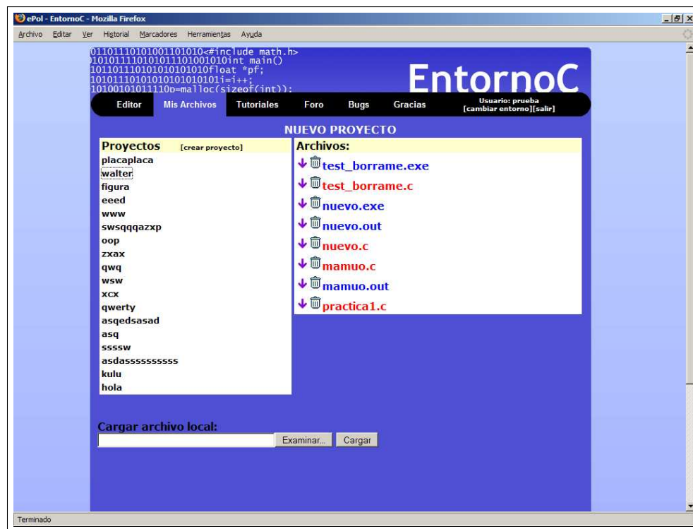
Figure 3: List of local files, with a colour code used to identify them.

Local files are shown as a list with a colour code used to identify them. Figure 3.