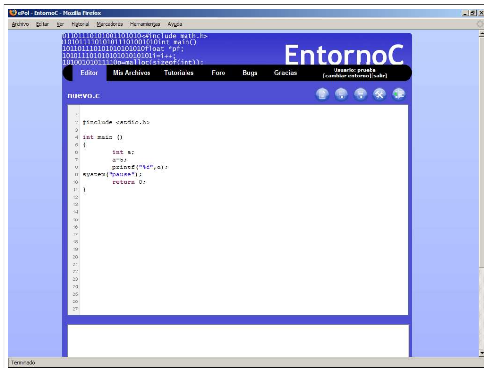
Figure 2: OLC Work screen. With the tabs menu, the tools bar, and two text areas: one for the code and the other one for the results.