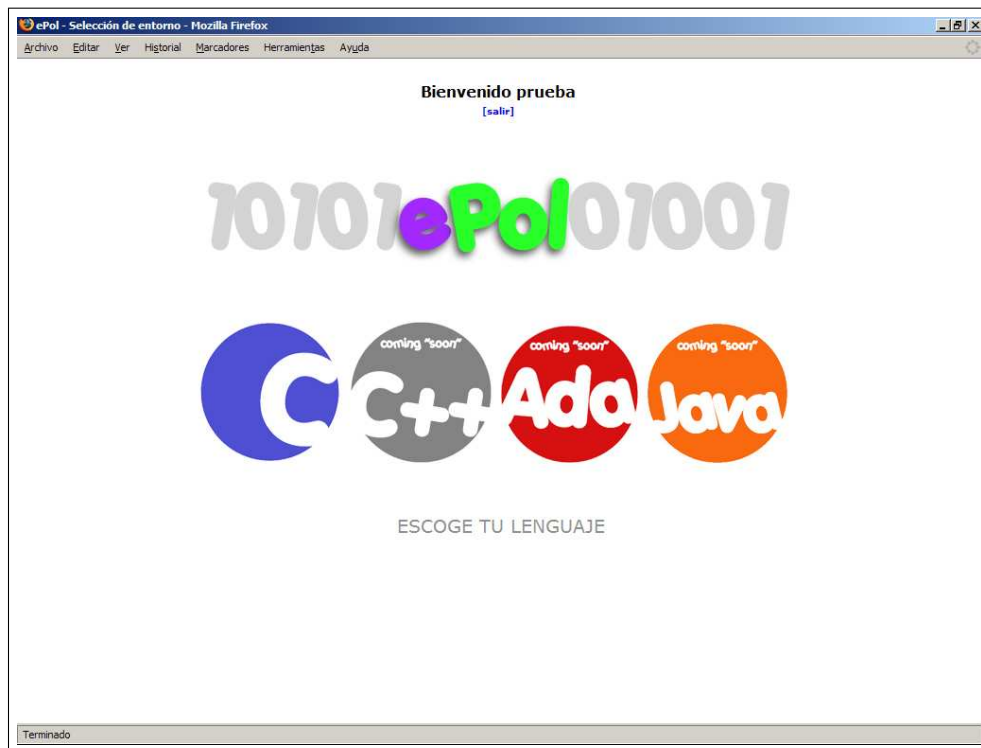
Figure 1: Welcome screen. Where the student chooses the programming language to work with.