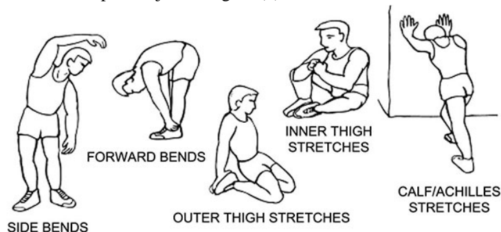
Fig. 1: Warm stretches before exercise

Private warm-up prepares the player in different respects and makes him ready to share in sport activity or any competition. Warm-up is necessary before fitness training of speed, power and technical training that needs speed, muscle contraction, extension and moving joints to full range. Warming-up prepare muscles to counter sudden movements in performance of technical training where the athlete will be safe from sports injuries. Figure (1) shows different warm stretches to be used before exercises.