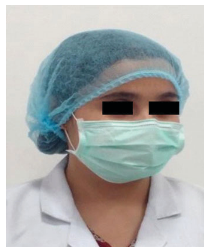
Figure 4: Cross infection measures-Facemask and Head cap.