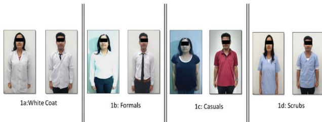
Figure 1: Different clinical attires- White coats (1a), formals (1b), casuals (1c), scrubs (1d).