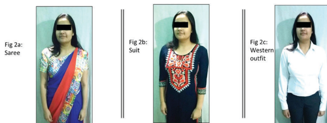
Figure 2: Different outfits for Indian female dentist- Saree (2a), Suit (2b), western outfit (2c).