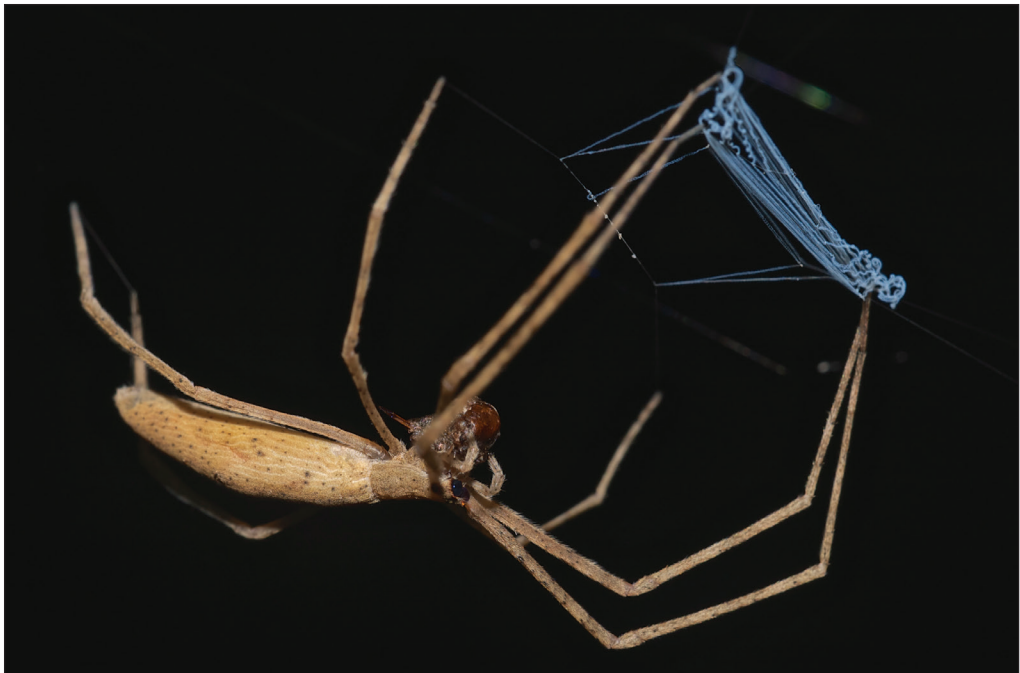
Figure 1. An adult Deinopis spinosa , Liberty County, FL.

All of the D. spinosa records we compiled are from the Coastal Plain physiographic province and include 1 barrier island (Sapelo Island, GA). In an attempt to map the putative and current range of D. spinosa in the southeastern US, we buffered all records and credible observations for northerly states (i.e., states north of Florida) by 160 km. We extended this buffer inland to, but not beyond, the margin of the Coastal Plain (Fig. 2).