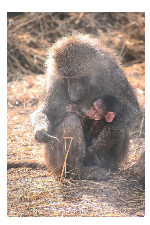
Figure 1. Maternal cradling in an adult female olive baboon. A baboon mother is cradling her baby on her left side.

On the other hand, right-side cradling is associated with higher pre-and postnatal maternal anxiety and depression<sup>24,25</sup>. Maternal depression involves decreased communication within the mother-infant dyad<sup>26</sup> and a dysfunction of the right brain hemisphere affecting emotional perception. It may therefore be considered as a factor that alters the left-cradling bias<sup>27</sup>. Other studies have found higher stress levels in mothers with a right-cradling bias, than in their counterparts cradling on the left<sup>28</sup>. Stress can immediately impact the infant cradling: under induced physiological stress conditions (identified by a higher blood pressure and heart rate), women hold a human-like doll more on the right<sup>29</sup>. In both 4 and 5-year-old boys and girls, the left-cradling bias is already strongly present when cradling a human infant-like doll, but can be reversed under unfamiliar or stressful stimuli<sup>5</sup>. Affective symptoms can therefore alter left cradling, reflecting a reduced ability to be emotionally involved with the infant.