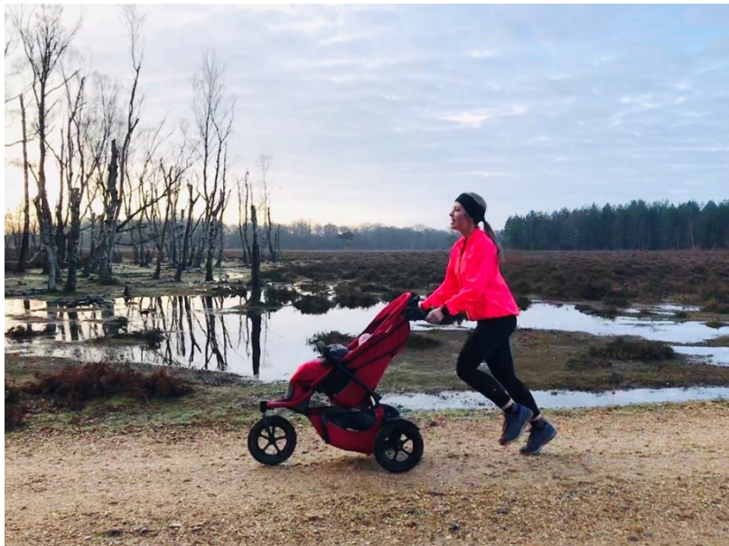
Buggy running, 6 months postnatal.

O'Sullivan (2015) found that running with a buggy leads to minor changes in trunk, pelvis and hip kinematics with no significant changes at the knee and ankle. Due to these changes in kinematics the authors suggest that flexibility work for the spine, pelvis, hips and gluteal strengthening exercises may be recommended for the runner.