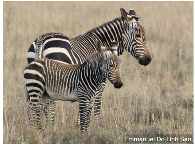
Emmanuel Do Linh San

The increase in available suitable habitat, is one reason for the sustained growth rate: for example, Anysberg and Gamkaberg nature reserves have both been expanded in area and a number of stewardship agreements (contractual nature reserve) are underway – some of which specifically favour the establishment of Cape Mountain Zebra. Privately-owned land played a crucial role in the conservation of the Cape Mountain Zebra when the last few groups in the Cradock area were saved from extinction by local farmers in the 1930s (Skead 2011). This subpopulation was formally protected in 1937 by the proclamation of the MZNP, which was expanded in 1964 to incorporate Cape Mountain Zebra groups occurring on neighbouring private farms (Penzhorn 1975). The expansion of formally protected areas such as the MZNP and Karoo National Park have facilitated the growth of the two largest subpopulations. The subsequent increase of the MZNP subpopulation enabled the translocation of individuals to 25 other protected areas during the 1980s and early 1990s, a number of which were private game ranches (Novellie et al. 2002). Similarly, Eastern Cape Parks and Tourism Agency (and its predecessors) have, since 2002, removed 235 Cape Mountain Zebra from Commando Drift and Tsolwana Nature Reserves (166 from Commando Drift and 69 from Tsolwana), of which 29 were