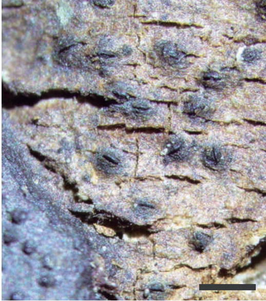
Fig. 1. Lophiotrema borealiforme . Ascomata in the inner bark of Betula , associated with Diatrype stigma (bar = 500 \mu\text{m} ). Holotype. – Photo: G. Mathiassen.

tendentia. Superficies ligni inter pseudothecia paulum obscurata. Peridium 25–40 \mu\text{m} crasum, textura plus minusve angulari. Extrema parte, lateraliter ad basim cellulae prismaticae strata aliquot saepe formant. Asci 70–90 (–100) \times (6–) 7–8 \mu\text{m} , stipitibus brevissimis, cylindrici, bitunicati, 8-sporei. Paraphysoides numerosae, anastomosantes, septatae, e filamentis (0.7–) 1.0–1.7 \mu\text{m} crassis formatae. Ascospores (12.5–) 14–17.5 (–18.7) \times 2.5–4 \mu\text{m} , ellipsoides vel fusiformae, interdum leviter curvatae, uniseptatae, constrictae, super septum paulo inflatiores, hyalinae, biseriatae, sive etiam oblique uniseriatae.