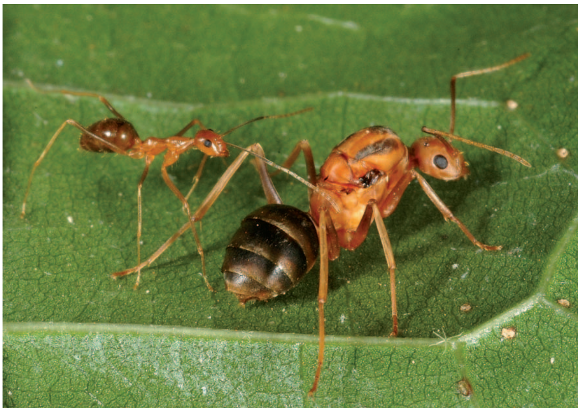
Fig. 1. Yellow crazy ant Anoplolepis gracilipes worker (left) and queen (right).

were the targets of most eradications (30 and 24 respectively). It is only in the last decade that the size of eradications has greatly increased, but the largest eradication covered only 41 ha. In contrast, approximately 3000 infestations covering approximately 15,800 ha were eradicated over the equivalent time using organochlorines, the largest eradication covering approximately 300 ha. We then discuss the current global status of ant eradication management options, and identify what we see as the actions that will provide the greatest immediate enhancement of invasive ant management, which are proactive management and greater incorporation of ant biology into eradication protocols.