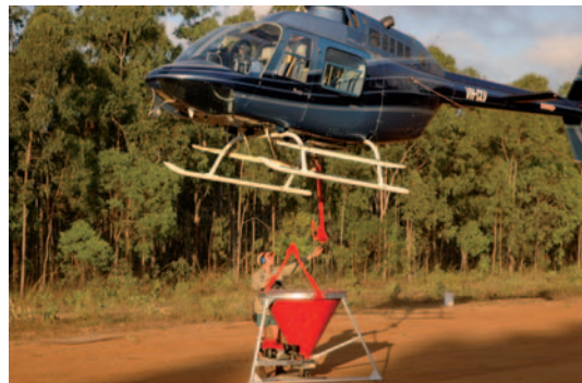
Fig. 4. Aerial treatments against yellow crazy ant Anoplolepis gracilipes in Arnhem Land, Australia, using a motorised bait dispenser slung under a helicopter. The helicopter flies along pre-determined flight paths guided by a differential GPS

Second is proactive surveillance. Early detection of incursions is often a critical factor for eradication success (Simberloff 2003; Lodge et al. 2006), but proactive surveillance for new incursions has been historically rare. Instead, most governments rely predominantly or even solely on passive surveillance, being the discovery and reporting of incursions by the public. Yet simultaneously, governments often apply a disincentive to report strange biota through charges for identification services.