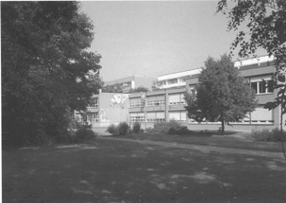
The socio-cultural centre Pusteblyume.

Other projects have been more temporary, like the idea of Hotel Neustadt , where children and theatre actors have occupied one of the empty housing estates to invite people to live in this enormous vacant space (Ludley, 1993). Other initiatives like the Kunstblock (art in public) want to revitalize the centre of Neustadt with arts projects (Herrmann et al. , 2002). The former railway station in Neustadt is intended to be a permanent exhibition space for contemporary art