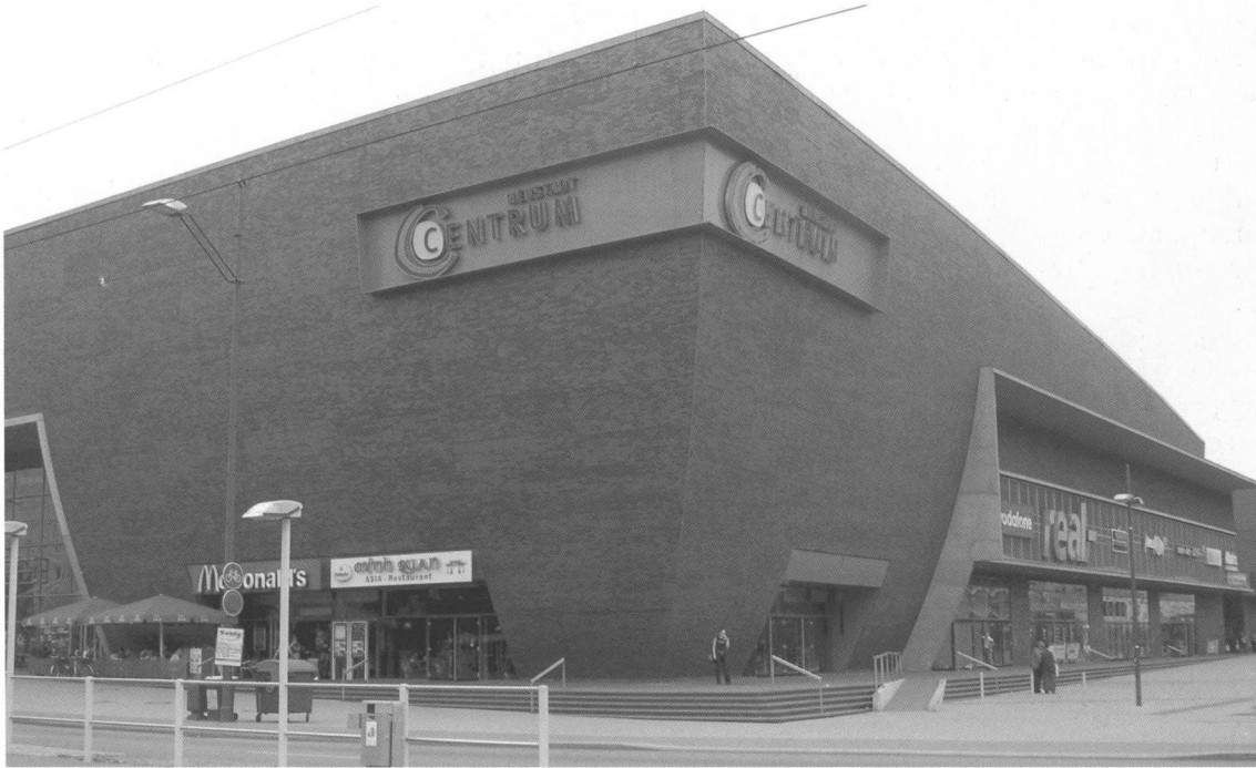
The Neustadt Zentrum opened in 2004.

Although the quality of this consumer choice was also mostly appreciated, the variety of other retailing was criticized as lacking ( Ibid. , p. 94). The customers criticized the fact that there was hardly any stimulating atmosphere in which to shop and to spend their time as well. There were complaints about the lack of consumer culture. The results of the survey were even more critical with regard to cultural opportunities in Neustadt at that time. Only 38 per cent of those interviewed felt that they would serve their needs. Asked what exactly was lacking in Halle-Neustadt, the inhabitants responded that they would like to have better quality gastronomy in first place. They missed a theatre, a central cultural house, more clubs and other cultural activities.