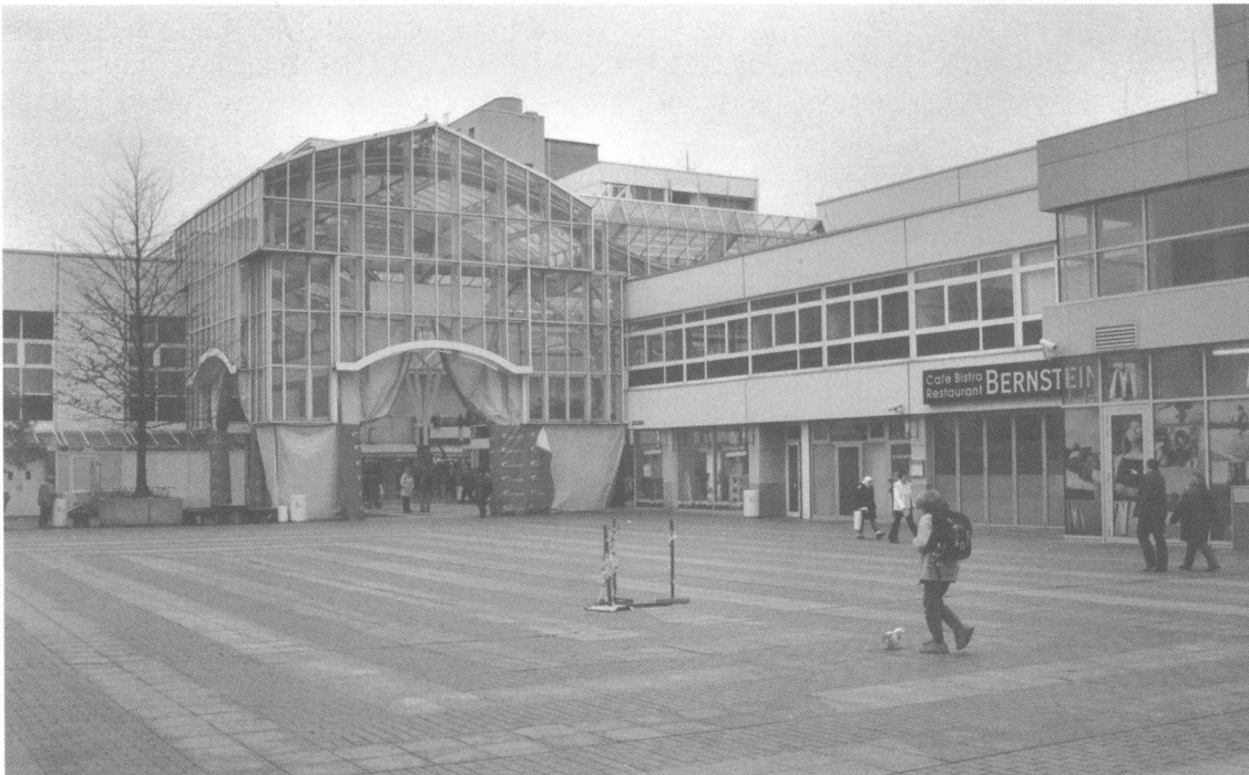
The entrance of the Nordwestzentrum today.

Paradoxically, the centre now seems to be accepted by a broad population. The flâneur ambling amongst the people and the hasty consumer are both to be found on any ordinary day. The centre has become a pleasant place to stay and enjoy time with the family. What the best intentions of urban planners and architects failed to achieve through philosophical concepts, private investors in their attempt to attract and bind clients to this place of consumption