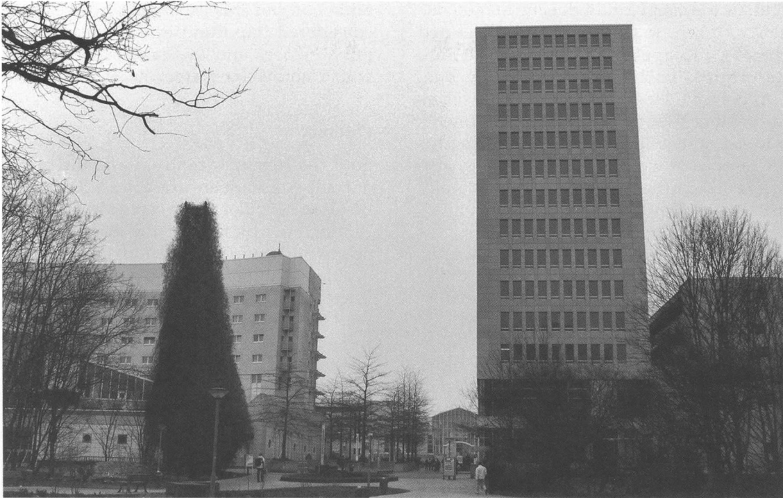
The Nordwestzentrum from the pedestrian area.

have done in the creation of some kind of 'urban place'. But this achievement is also generated by the widespread fear of crime that was shared by many Frankfurters in the 1990s. Surveillance and private security organizations make the centre a safe place. This has created new forms of exclusion and the new urbanity of the Zentrum has developed a kind of artificiality and rigidity. Unwelcome in the new consumer paradise are all kinds of people not fulfilling the superficial visual check by the guards who prevent the homeless, street musicians, beggars, junkies, street retailers and other 'suspected' persons from entering the centre. No political demonstrations, no loitering, no graffiti and no crime take place there.