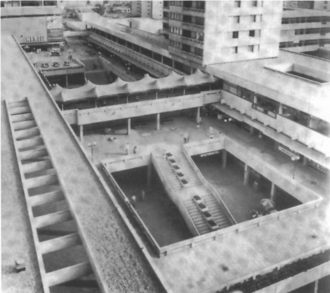
The Nordwestzentrum before renovation.