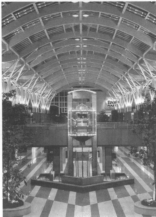
Above: The Nordweststadt from above. Below: The new shopping centre in the Nordweststadt