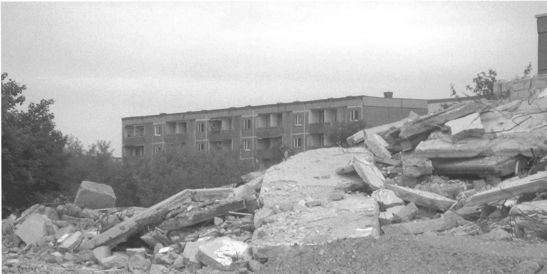
Above: Demolition in Stadtumbau Ost. Below: Socialist art in public space.