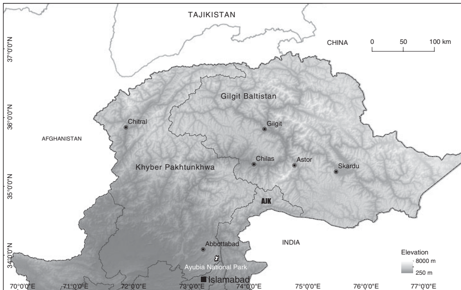
FIG. 1 North-east Pakistan, showing the location of Ayubia National Park.

reported from the Machiara National Park, Azad Jammu and Kashmir (Dar et al., 2009) during a 3-year period, indicating that the common leopard is the major livestock predator (90%) in the Park. Kabir & Waseem (2010) documented 72 livestock losses from the Pir Lasora National Park, Azad Jammu and Kashmir, comprising goats Capra hircus (46%), domestic dogs Canis lupus familiaris (32%), sheep Ovis aries (17%) and cows Bos taurus (4%). In addition to depredation on domestic livestock there has been an increase in the number of reports of fatal attacks on humans by leopards.