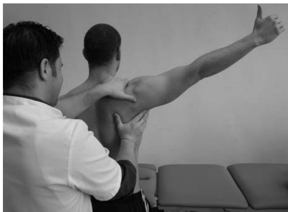
Figure 8 The scapular assistant test.

The SAT and SRT are a unique possibility to register a direct connection between the patients' symptoms and his/her scapular static or dynamic properties. Therapists can reliably use these tests to support the Trapezius-Serratus Anterior force couple during retraining. Reliability of the SRT was suggested to be sufficient. 56 However, validity of the SRT still need to be reported before any conclusions can be made. These tests are important when addressing a symptomatic population. Asymmetry appeared to be common in both the symptomatic and