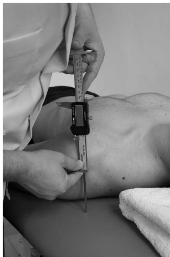
Figure 2 The measurement of the distance between the posterior border of the acromion and the examining table.

Forward shoulder posture can also be measured using the Baylor square or double square technique , described by Peterson et al 34 The square consists of a simple carpenter's square having a 24-inch long arm and a 16-inch short arm. During the Baylor square technique, the tester uses this tool to measure (in a sagittal plane) the distance from the anterior tip of the acromion process to the line, perpendicular to the C7 spinous