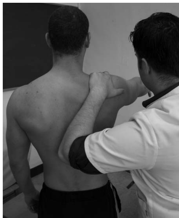
Figure 7 The scapular repositioning test during the empty can position.

The scapular retraction/repositioning test (SRT, figure 7) has been described by Tate et al. 56 If a positive impingement test is identified, it can then be repeated with the scapula manually repositioned using the SRT. The SRT is performed by grasping the scapula with the fingers contacting the acromioclavicular joint anteriorly and the palm and thenar eminence contacting the spine of the scapula posteriorly, with the forearm obliquely angled towards the inferior angle of the scapula for additional support on the medial border. In this manner, the examiner's hand and forearm applies a moderate force to the scapula to encourage scapular retraction (scapular retraction test) or posterior tilting and external rotation (scapular repositioning test),