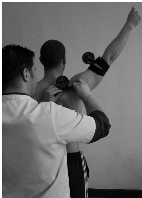
Figure 5 Measurement of scapular upward rotation by means of two inclinometers.

The measurement of scapular upward rotation (figure 5) can be performed by using two Plurimeter-V gravity references inclinometers. 45 The relative contribution of the glenohumeral joint and the scapula to total shoulder abduction within the coronal plane is assessed. One inclinometer is velcro taped perpendicular to the humeral shaft, just above the humeral epicondyle. The resting position of the humerus is recorded. Next, the