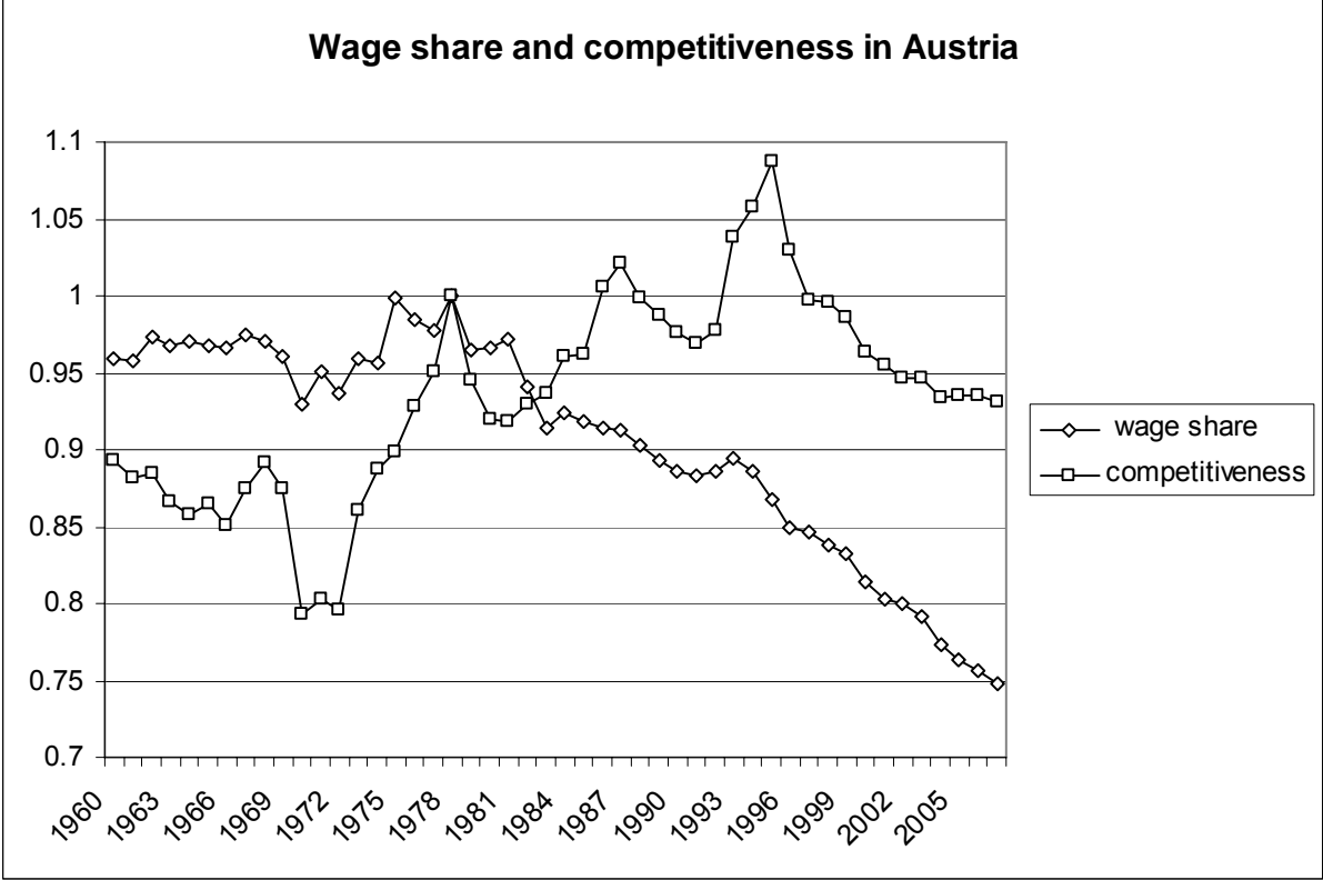
Figure 2: Wage share and competitiveness in Austria

Note. The wage share is the adjusted wage share at factor costs; competitiveness is the nominal unit labor costs, performance relative to the EU15 with double export weights. Both are standardized 1979 = 100.