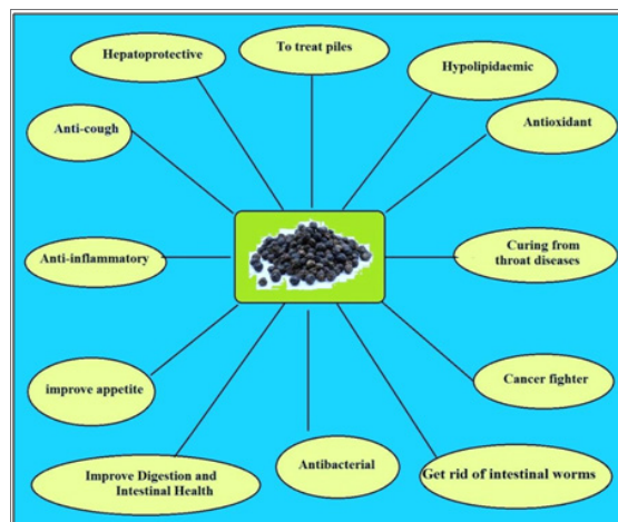
Figure 1 Some uses of the black pepper fruits in traditional medicine

antimutagenic, antioxidative, antipyretic, antispasmodic, antitumor, to improve appetite and digestive power, anti-cold, anti-cough, dyspnea, for curing from throat diseases, anti-intermittent fever, anti-colic, anti-dysentery, get rid of worms and piles, 14,15 some of these uses are illustrated in Figure 1.