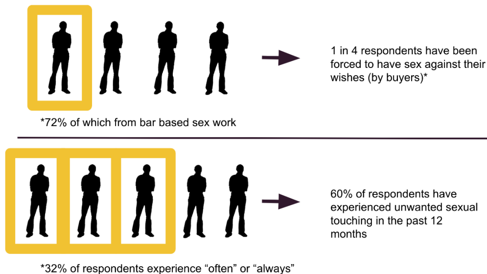
Figure 2. Violence and sexual abuse experienced among respondents.