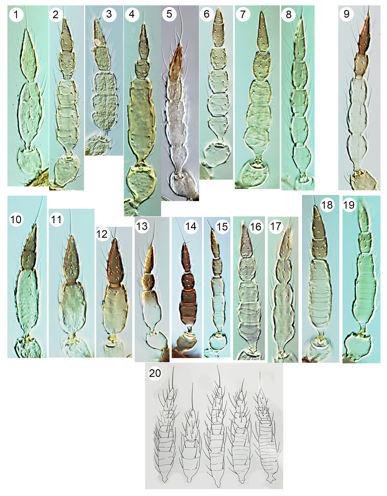
FIGURES 1–20. Antennae of urothripines. (1) Amphibolothrips grassii; (2) A. knechteli; (3) Conocephalothrips tricolor; (4) Bebelothrips flavicinctus; (5) Baenothrips guatemalensis; (6) B. moundi; (7) B. chiliensis; (8) B. cuneatus; (9) Bradythrips hesperus; (10) Stephanothrips buffai; (11) S. uvarovi (paratype); (12) S. uvarovi (Brazil); (13) S. howei; (14) S. barretti; (15) S. broomei; (16–17) S. erythrinus (paratypes); (18) S. austrinus; (19) S. adnatus; (20) Antennae of five Asian Stephanothrips species in Okajima (1989).