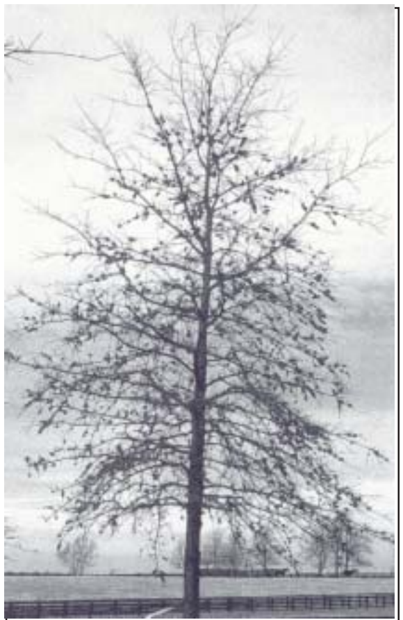
Figure 1. Pin oak tree that is heavily infested with twig galls induced by Callirhytis cornigera in Lexington, Kentucky.

blisterlike leaf galls, respectively. The leaf-galling stage is inconspicuous, but the golf-ball-sized stem galls are noticeable and unsightly, especially after leaf fall (Figures 1 and 2B). Heavily infested oaks may have multiple stem galls on 80% or more of their branches, disfiguring the tree and causing crown dieback (Whyte and Ford 1980; Johnson and Lyon 1988; Eliason 1999).