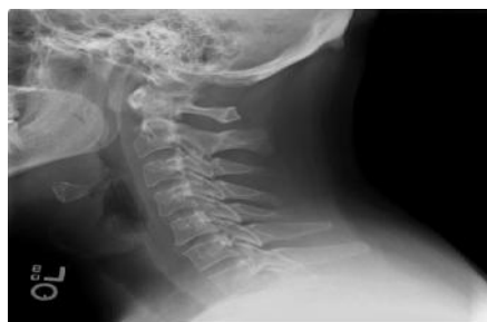
Fig. 5. A radiograph of a subject 6 weeks post traction

The significant reduction in pain intensity recorded among the traction group could be attributed to the alternation of upright distraction traction with flexion traction at subsequent visits during the treatment period. This is in agreement with the work of Rana and Crystal [12] and Murphy and Lieponi [11] who observed that flexion traction with 4 to 6 kg takes care of pressure of osteophytes on the vertical floor of the neural canal.