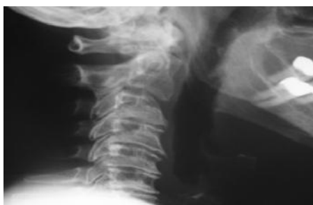
Fig. 3. A radiograph of a subject showing degenerative cervical spondylosis

Also the use of high weight was beneficial since a consistent decline in the magnitude of the pain was observed throughout the treatment period as illustrated in Figs. 2 and 3. This is in line with the observations of Hinderer and Biglin [6] and Rana and Crystal [12]; who stated that at least 12.5 kg weight is necessary to distract the cervical spine before the beneficial effects of traction can be “sustainably” observed. Thus, we wish to observe that weights equal or greater than 12.5 kg to a maximum tolerable limit of the patient needs be achieved for a sustainable progressive pain relieve to occur. This buttresses Saunders [3] criticism of the report on traction by the Royal College of General Practitioners of London that the patients in their series were under-loaded.