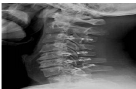
Fig. 4. A radiograph of a subject showing osteophyte formation