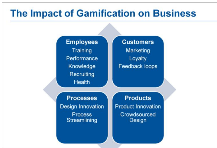
Fig 4: Impact of Gamification on Business