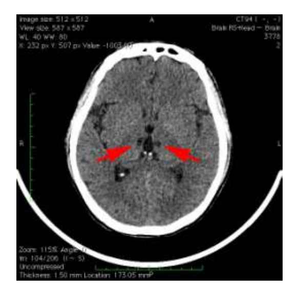
Figure 1. Head CT scan demonstrating a small hypodense lesion in bilateral paramedian thalamic (red arrows)

Coma Scale (GCS). Fundus was normal. His pupils were 5 mm in diameter and fixed with no response to light. He had bilateral ptosis. His reflexes were symmetrically brisk. Oculocephalic maneuvers could not elicit horizontal or vertical eye movements. No facial droop was noted. Gag reflex was present.Signs of meningeal irritation were absent. Routine laboratory investigations were normal.