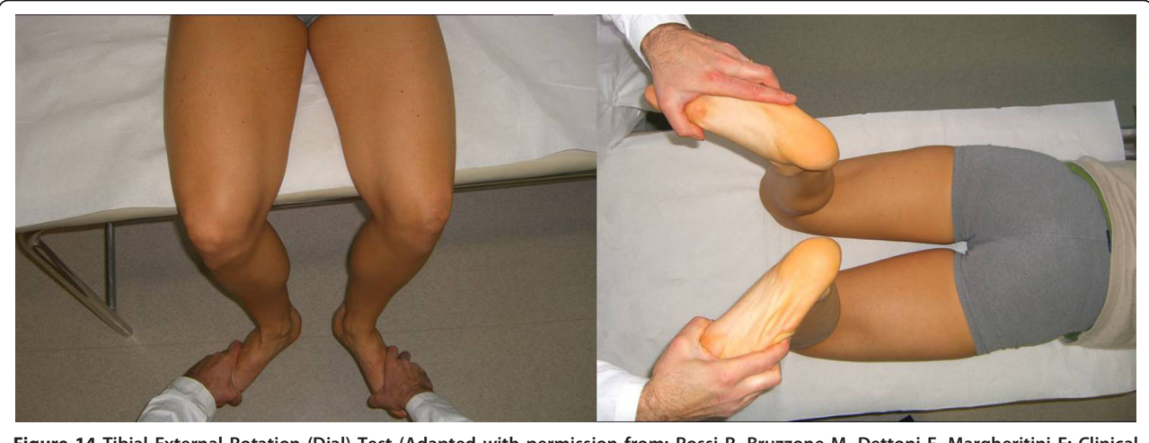
Figure 14 Tibial External Rotation (Dial) Test (Adapted with permission from: Rossi R, Bruzzone M, Dettoni F, Margheritini F: Clinical examination of the knee. In: Orthopedic Sports Medicine, Principles and Practice. Edited by Margheritini F, Rossi R. Milan: Springer; 2010).

tibial not only rotates externally, but subluxes posteriorly as well: reducing the tibia on the lateral femoral condyle with a finger further increases the amount of external rotation (Figure 14).