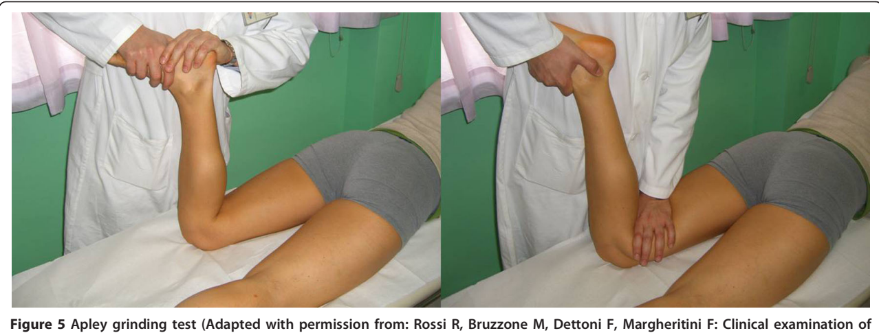
Figure 5 Apley grinding test (Adapted with permission from: Rossi R, Bruzzone M, Dettoni F, Margheritini F: Clinical examination of the knee. In: Orthopedic Sports Medicine, Principles and Practice. Edited by Margheritini F, Rossi R. Milan: Springer; 2010)

the test is positive for medial meniscal tear if raises pain upon externally rotating, while it is positive for lateral meniscal tears in case of pain during internal rotation.