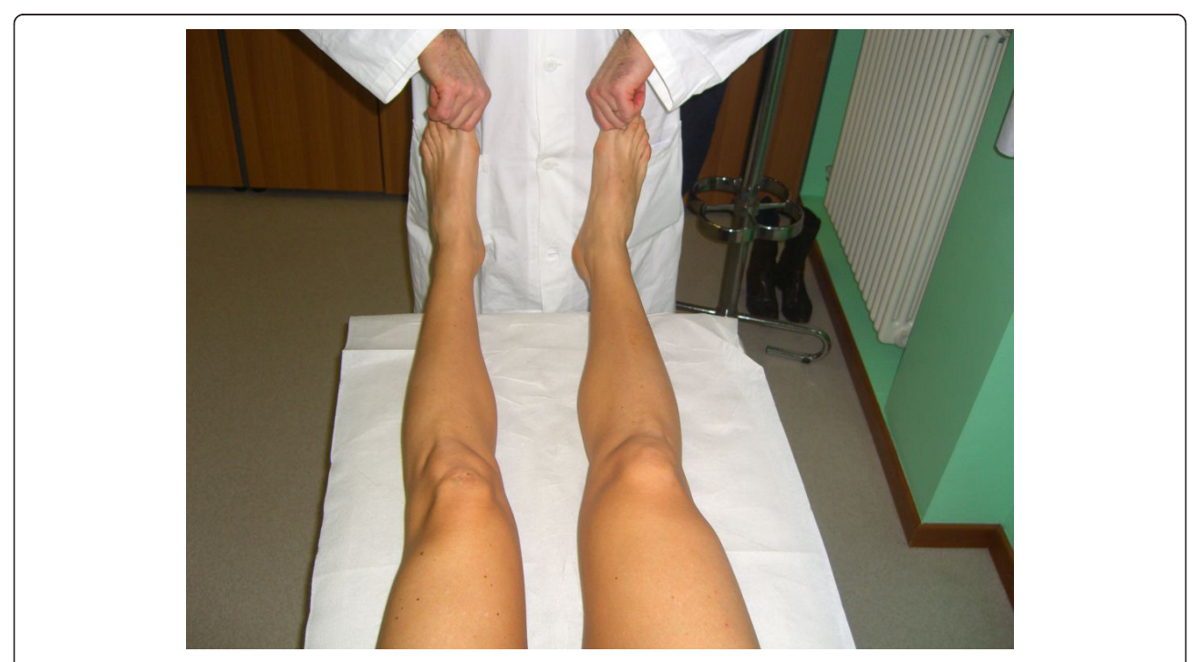
Figure 15 External Rotation Recurvatum Test (Adapted with permission from: Rossi R, Bruzzone M, Dettoni F, Margheritini F: Clinical examination of the knee. In: Orthopedic Sports Medicine, Principles and Practice. Edited by Margheritini F, Rossi R. Milan: Springer; 2010).

The Posterolateral External Rotation (Drawer) Test is a combination of the posterior drawer and external rotation tests: with the knee flexed at 30° and then at 90°,