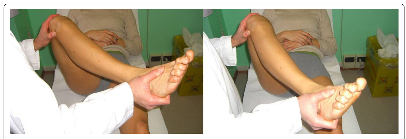
Figure 4 The figure of four meniscal stress maneouver (Adapted with permission from: Rossi R, Bruzzone M, Dettoni F, Margheritini F: Clinical examination of the knee. In: Orthopedic Sports Medicine, Principles and Practice. Edited by Margheritini F, Rossi R. Milan: Springer; 2010).

In Steinmann's first test the knee is held flexed at 90° and forced to external rotation, then internal rotation: