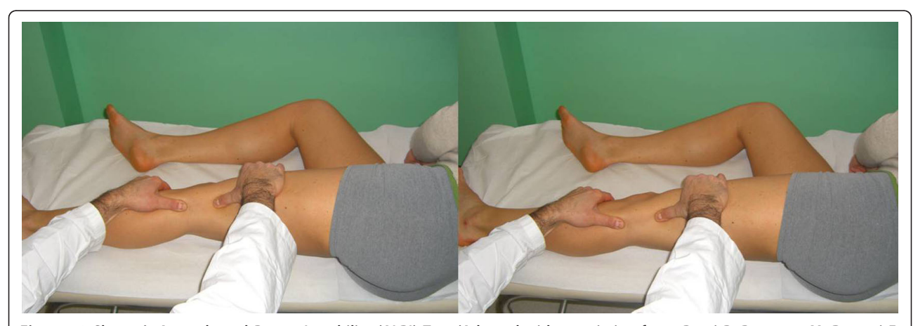
Figure 13 Slocum's Anterolateral Rotary Instability (ALRI) Test (Adapted with permission from: Rossi R, Bruzzone M, Dettoni F, Margheritini F: Clinical examination of the knee. In: Orthopedic Sports Medicine, Principles and Practice. Edited by Margheritini F, Rossi R. Milan: Springer; 2010)

The Tibial External Rotation (Dial) Test evaluates the amount of increased passive external rotation of the tibia in different positions of the knee. The supine position is more comfortable for the patient, but in the prone position the hip is held in its position by the patient's weight, thus eliminating the rotator effect of the hip. The leg should be held at 30° and 90° flexion, while in full extension the lateral gastrocnemius tendons are tightened, and reduce the external rotation drive. The test is positive when the affected knee rotates externally 10° more than the unaffected knee. In the flexed position the proximal