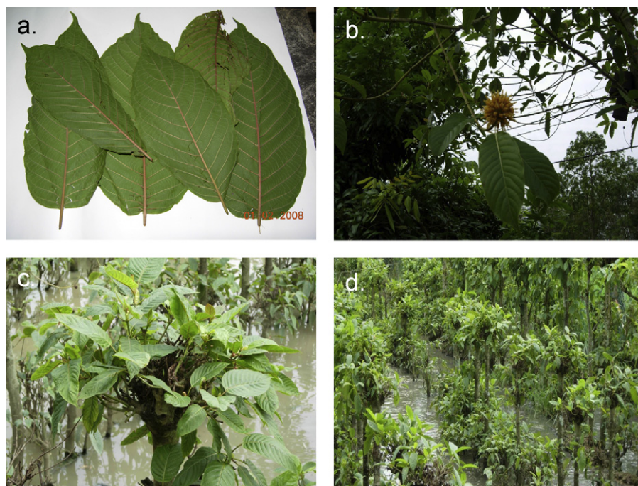
Fig. 1. The plant Mitragyna speciosa Korth. (a) Leaves of the plant, (b) naturally occurring trees, (c and d) cultivated plants.

Suwanlert (1975) investigated 30 Thai Kratom users, who were older and married men abusing Kratom over 5 years. They reported stimulant effects 5–10 min after chewing the leaves which lasted 1–1.5 h. Users reported an increase in work output and tolerance of hot sunlight (Grewal, 1932a,b; Macko, 1972).