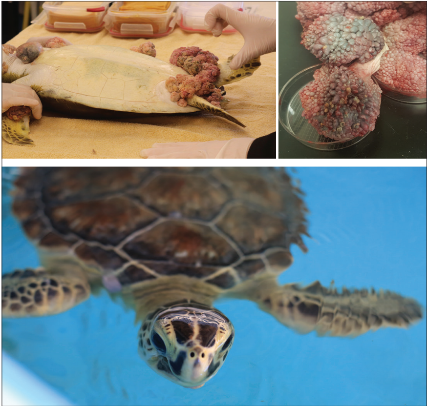
Fig. 1. Green turtles ( C. mydas ) at the UF Whitney Laboratory Sea Turtle Hospital, Florida, afflicted with fibropapillomatosis tumours. Top left: juvenile green turtle being evaluated prior to surgery. Top right: fibropapillomatosis tumour after surgical excision from patient. Bottom: green sea turtle in hospital rehabilitation tank.

bearing wild turtles (Brill et al. 1995), and found that tumour-bearing turtles surfaced less frequently at night than those without tumours, suggesting that FP tumours may impact turtle respiration. Compromised respiration therefore may affect their resting and foraging behaviour, negatively impacting their energy budgets (Brill et al. 1995). Some research has been carried out into the behaviour of healthy captive green turtles (Therrien et al. 2007), but to our knowledge the behaviour of turtles being treated for FP has not been documented. In other reptile species, minimally invasive procedures such as microchipping have been found to have a prolonged effect on stress levels (Langkilde & Shine 2006). Given that surgical tumour removal is more invasive than microchipping, it may be assumed that surgery would also have an effect on sea turtle stress levels. Although it is broadly accepted that FP