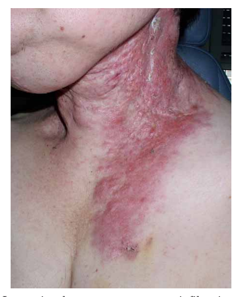
Fig. 3. Locoregional cutaneous metastases infiltrating the skin on the whole left side of the neck and upper pectoral region.

therapy but died due to respiratory failure caused by pulmonary lymphangiosis.