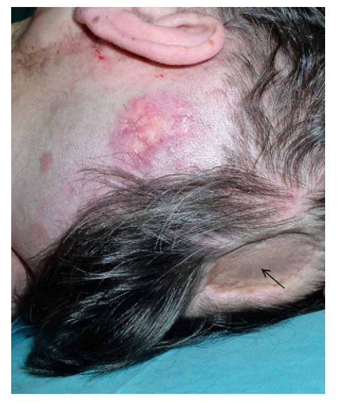
Fig. 2. Local recurrence of the tumor in the left retroauricular region. Original site of tumor covered with skin grafting (black arrow).

The patient was well and asymptomatic for 10 months, when the local recurrence appeared in the left retroauricular region (Figure 2). The ultrasound examination of the neck with fine-needle aspiration biopsy revealed contralateral cervical lymph node metastases. The patient underwent tumor re-excision, reconstruction of the