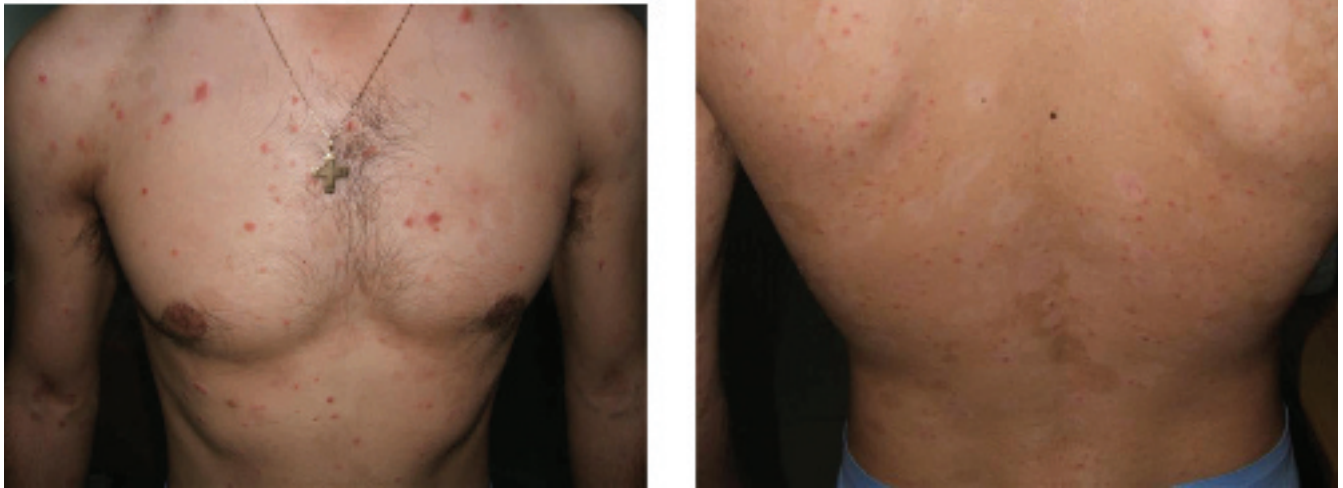
Figure 1. This is the third week after the initiation of efalizumab. No meaningful response is seen.