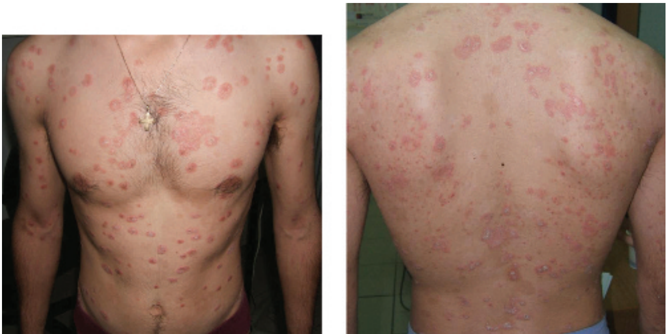
Figure 2. This is the eleventh week of treatment with efalizumab. The exacerbation of papular psoriasis can be noticed by comparison with Figure 1.