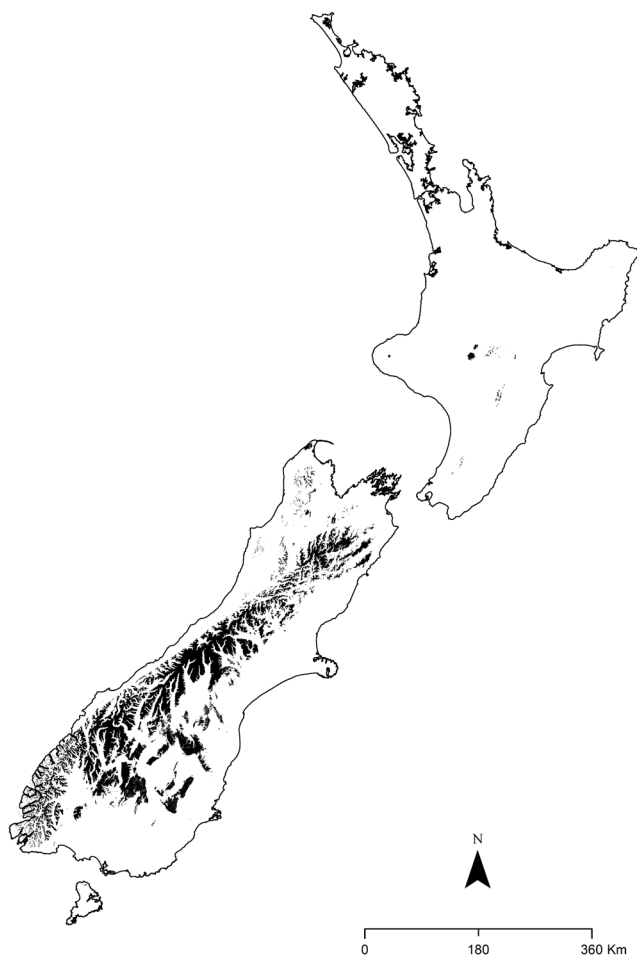
Figure 1. Estimated extent of the New Zealand alpine zones using ArcGIS for Desktop Spatial Analysis Tools. Spatial extent was estimated by creating a minimum height raster based broadly on a regression in treeline altitude of -100 m elevation for every degree in latitude southwards, starting at 2100 m.a.s.l. at the northern tip of the North Island (Cieraad & McGlone 2014). A 25 metre digital elevation model (DEM) provided by Landcare Research NZ with the minimum height raster was then overlaid to find all areas where the DEM value was above the minimum height value. The resulting area was extracted to a polygon, extracting the following land cover areas provided from the NZ Land Cover Database (LCDB v 4.1): Permanent snow and ice, gravel or rock, landslide, alpine grass/herbfield, sub alpine shrubland, and tall tussock grassland.

alpine zone, tall tussock species give way to shorter grasses, dwarf shrubs and cushion or turf-forming herbs in fellfields; growth forms indicative of the high alpine zone (Mark & Dickinson 1997). As a consequence of relatively recent rapid tectonic activity and glaciations, phylogenetic radiations of plants and animals have been extensive in the alpine zone, especially among plant and invertebrate communities, but including reptiles and birds (Wallis & Trewick 2009). Floral diversity throughout the alpine zone is high, with >600 species of vascular alpine plants, the majority of which (c. 93%) are endemic (Mark & Adams 1995).