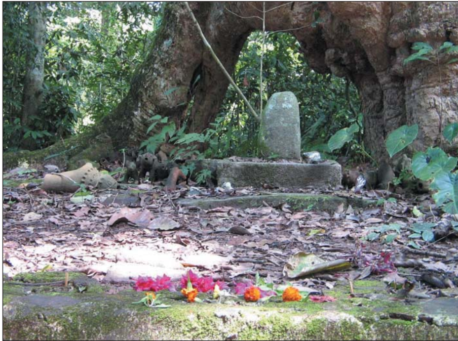
Figure 2. Sacred grove dedicated to the god Aiyappa in Biligunda village, Kodagu, Western Ghats, India. Sacred groves are small patches of forest dedicated to ancestral or deity worship. These patches often have a long history of protection and shelter natural vegetation, including some very old trees.

community, as well as fair enforcement of the agreed rules, strong organizational and institutional arrangements, and constructive dialogue. We agree with Brechin et al. (2002), and would further argue that informal conservation traditions also have a high degree of acceptance among local communities. If the merits of such traditions are recognized and legitimized within ICDPs, there is a strong possibility that ICDPs will work much better than they do at present.