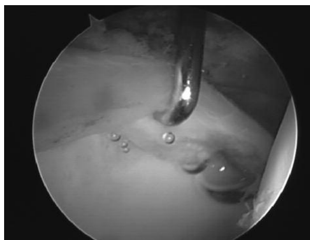
Fig. 1. — View from the lateral portal displaying an extensive anterosuperior labral tear.

On examination she had mild tenderness over the greater trochanter and positive signs for labral pathology on the right. Radiographs of the pelvis did not reveal any evidence of osteoarthritis or evidence of acetabular retroversion and there was normal coverage of the femoral head (Centre-Edge angle 40°) and normal Tönnis angle. A magnetic resonance (MR) arthrogram of the right hip suggested a small tear at the base of the anterosuperior labrum. The \alpha -angle measured 45°.