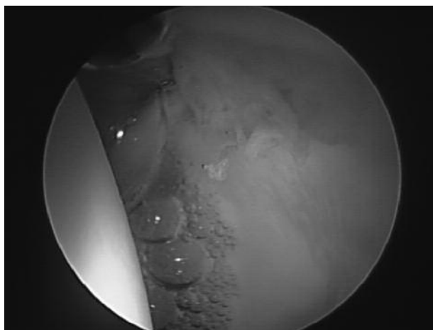
Fig. 2. — View from the lateral portal showing the degenerative labral tear.