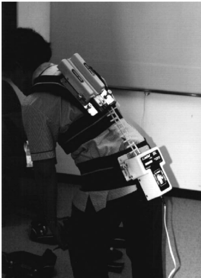
Figure 1. The Lumbar Motion Monitor.

Two identical acute orthopaedic wards were outfitted with new beds. One ward received electric beds (M5 Electric Ward Bed, Howard Wright Ltd, New Plymouth, New Zealand) and the other received new manual patient beds (Howard Wright M5 Ward Bed, an identical bed without the electric mechanism).