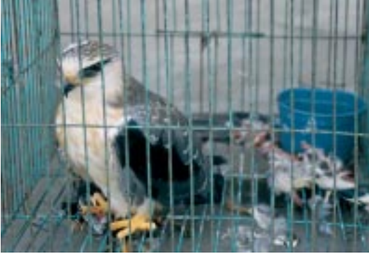
Plate 7. Black-winged Kites Elanus caeruleus were the most commonly observed raptor in trade during this study.

CHRIS R. SHEPHERD, TRAFFIC SOUTHEAST ASIA