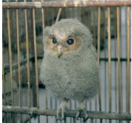
Plate 10. A young scops owl Otus sp. to be sold as a novelty pet.

Harvest quotas are divided by province, with a limited amount being allowed from each designated area. Wildlife cannot be harvested from a province that has no allotted quota. If an exporter does not finish the allotted quota in a year, it is forfeited—the remaining volume that was not realized cannot be added to the following year's quota.