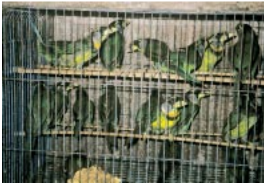
Plate 2. Fire-tufted Barbets Psilopogon pyrolophus in cages. There is no legal capture or trade of this species in Indonesia.

CHRIS R. SHEPHERD, TRAFFIC SOUTHEAST ASIA