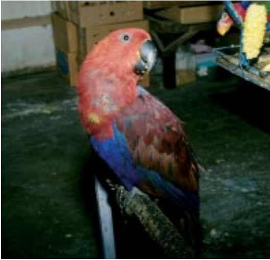
Plate 14. A female Eclectus Parrot Eclectus roratus for sale in the market. This species, and many other parrots and cockatoos, are smuggled from eastern Indonesia to Medan for sale. Many are sold illegally to international buyers from this market.