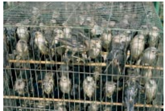
Plate 13. Purple-backed Starling Sturnus sturninus crammed into cages for sale in Medan.