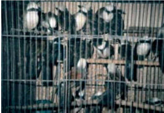
Plate 1. White-crested Laughingthrush Garrulax leucolophus of both the Sumatran and mainland South-East Asian subspecies are commonly sold in the markets. Dealers claim that this species is becoming increasingly scarce on Sumatra.