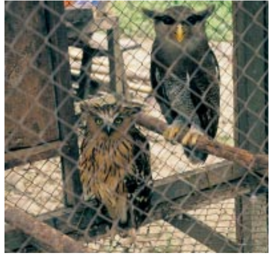
Plate 15. A Buffy Fish-owl Ketupa ketupu and a Barred Eagle Owl Bubo sumatranus await sale in a roadside cage.