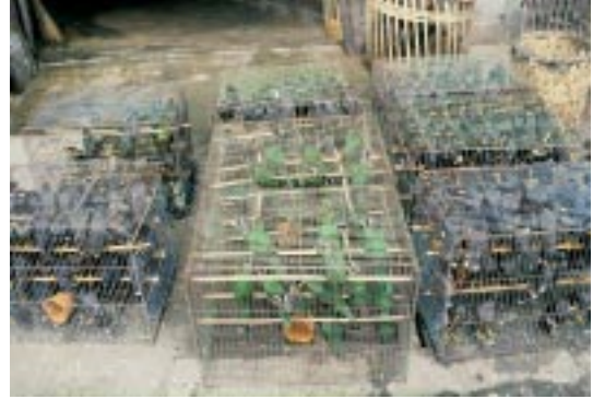
Plate 9. Fire-tufted Barbets Psilopogon pyrolophus and Javan Mynas Acridotheres javanicus are sold in large quantities in the Medan bird markets.