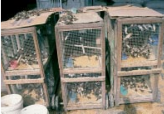
Plate 11. White-headed Munias Lonchura maja and Scaly-breasted Munias L. punctulata are sent in large volumes to Malaysia and Singapore. These birds suffer very high mortalities, even before export—note dead birds on top of cage.

CHRIS R. SHEPHERD, TRAFFIC SOUTHEAST ASIA