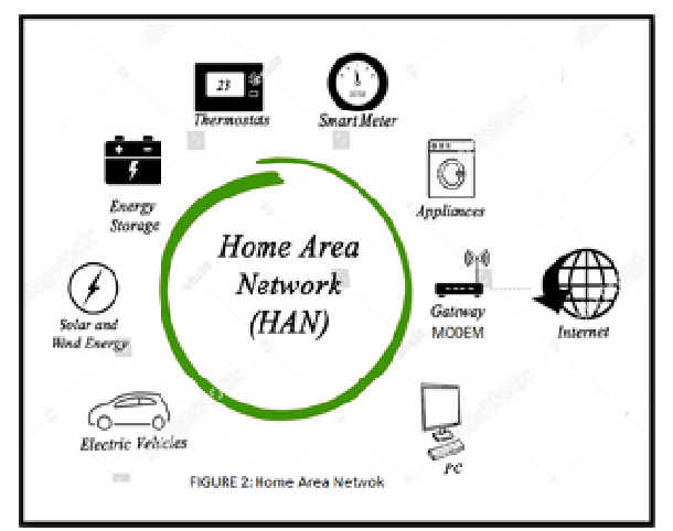
Fig. 3 Home area network

HAN is applicable for home automation. It is used for the arc consumer domain and consists of electronics appliances and wireless sensor networks. These consumer electronics appliances communicate their energy consumption statistics to central home monitor and regulator or smart meter. Central regulator or smart meter sends it to the central electricity grid for monitoring, control, fault detection and billing purposes. Smart meters and intelligent electronic devices receive the commands from central power grid and they control the home appliance based on the received commands. Home Area Networks (HANs) have the coverage area of few meters. IEEE 802.15.1 (Bluetooth), IEEE 802.15.4 (Zigbee), IEEE 802.11 (WLAN/Wi-Fi), IEEE 802.3 (Ethernet), Narrowband PLC (Power line communication), etc. standards can be used for Home area networks .