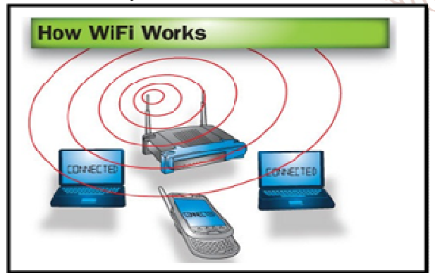
Fig. 6 WiFi Sensor Wireless Network

Wireless Fidelity (Wi-Fi) or wireless local area network technology is established on the basis of IEEE 802.11 standard. Wireless local area networks are prevalent for LAN applications with peak data rates of around 150 Mbps and extreme coverage range of 250 m. Wi-Fi (IEEE 802.11b) operating on 2.4 GHz band achieves maximum data rates of 11 Mbps. Other versions based on IEEE 802.11a standard operates in 5.8 GHz band using Orthogonal Frequency Division Multiplexing (OFDM) and IEEE 802.11g (improved version of Wi-Fi) operating on 2.4 GHz band provides data rate up to 54 Mbps. IEEE 802.11 provides data rates of up to 600 Mbps using Multiple Input-Multiple Output (MIMO) technology. Security concerns for Wireless local area networks are addressed and solved in IEEE 802.11i standard using Wi-Fi Protected Access (WPA-2) encryption. It uses an Advanced Encryption Standard (AES). The main feature of Wi-Fi is existing wide support in most of the electronic arc In this paper we presented the different communication devices. It is an upper layer protocol which allows communication over an Internet without using a protocol translator. Restricted number of channels can be used without an overlap in Wi-Fi/WLAN. This means that a restricted number of wireless clients can be connected in a Network. However, advantages of Wi-Fi are high data throughput, wide spread availability, IP support and network scalability.