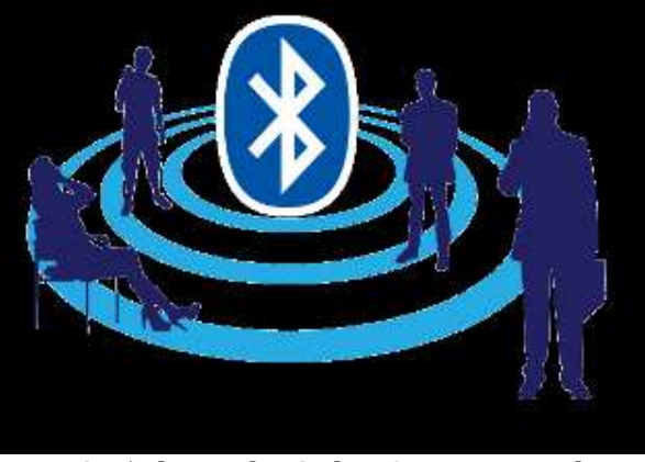
Fig. 5 Bluetooth Wireless Sensor Network

International Journal of Trend in Scientific Research and Development (IJTSRD) @ www.ijtsrd.com eISSN: 2456-6470