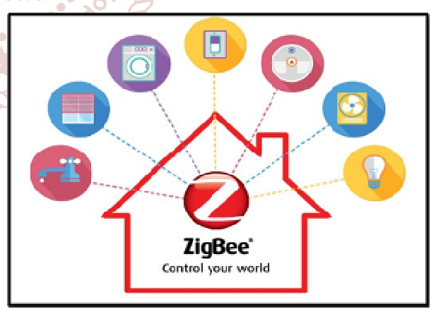
Fig. 4 Zigbee Wireless Sensor Network

Zigbee is based on IEEE 802.15.4 standard. It is an energy proficient short range wireless communication technology. It functions in the ISM (Industrial, scientific and medical) band which is allocated for industrial, scientific and medical applications. Zigbee operates in the band of 2.4 GHz, 868 and 928 MHz with full duplex wireless data transmission. IEEE 802.15.4 standard describes physical layer and media access layer and Zigbee Alliance has expanded the configuration of an application layer and network layer. The maximum throughput achievable by Zigbee is 250 Kbps. Zigbee can play an imperative role in operation and maintenance of power grid, data accumulation, parameter measurement, security, monitoring and consumer interface.