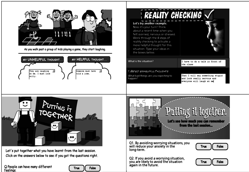
Figure 1. Use visually appealing and interactive activities for the child and teenage programs

relating to the previous session, and ends with a summary and quiz relating to the current session. The young person is provided with automated feedback regarding the accuracy of their responses via pop-ups, to ensure their understanding of key concepts. Interactive games are another technique used to present and consolidate program information in an interesting way.