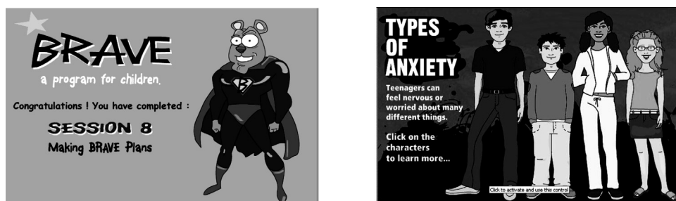
Figure 2. The use of characters to illustrate techniques for managing anxiety