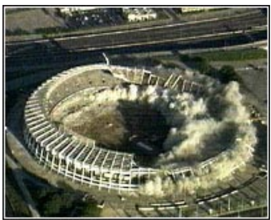
Like a set of dominoes, the former home of the Atlanta Braves collapsed Saturday

also known as TOTAL REWRITE DEMOLITION THROWAWAY THE FIRST ONE START OVER