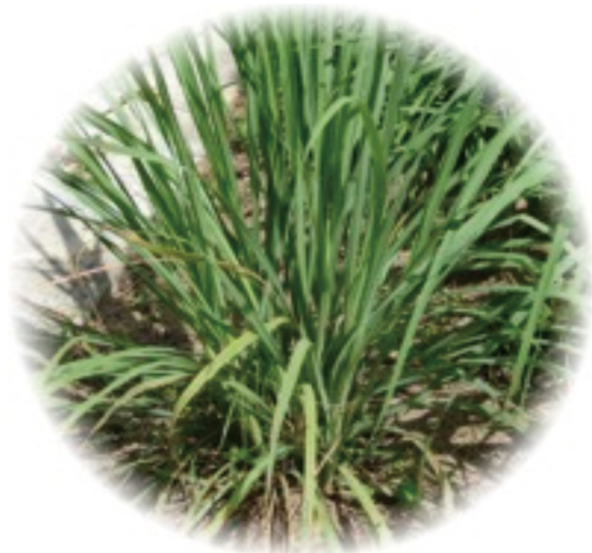
Figure 1. Lemongrass plant ( C. citratus ).

Lemongrass is a tropical perennial plant which yields the Cochin oil of commerce. It is known as Bhustarah in Sanskrit, Gandhatran in Hindi, Injippullu in Malayalam, Vasanapullu in Tamil, Majjigehallu in Kannada and Nimmagaddi in Telugu (Figure 1). The name of lemongrass is derived from the typical lemon-like odour of the essential oil present in the shoot. Cymbopogon citratus ( C. citratus ) flourishes in sunny, warm, humid conditions of the tropics. In Kerala short periods above 30 °C have little general effect on plants, but severely reduce oil content. Lemongrass flourishes in a wide variety of soil ranging from rich loam to poor laterite. Calcareous and water-logged soils are unsuitable for its cultivation [4] . Plants growing in sandy soils have higher leaf oil yield and citral content. Lemongrass will grow and produce average herbage and oil yields on highly saline soils.