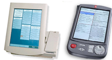
Fig 3: Diebold AccuVote-TS system (Left) and Hart InterCivic eSlate system (Right)

(v) Diebold AccuVote-TS: The Diebold AccuVote machine is the system that tested [2], and is in use in the State of Maryland. It uses a touch screen (Fig. 3) with a card reader that the voter gets after being authenticated by polling officials.