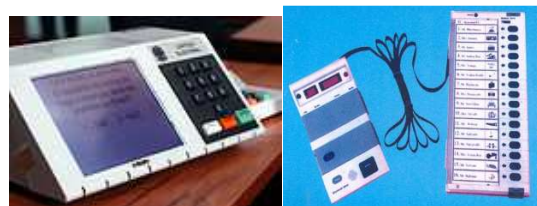
Fig.1. DRE Voting system Fig 2. Indian Voting Machine

(ii) Direct-recording electronic (DRE) voting system: Electronic voting machine by Premier Election Solutions formerly Diebold Election Systems used in all Brazilian elections.