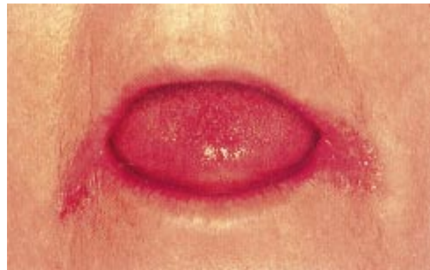
Figure 4 Angular cheilitis.

Median rhomboid glossitis is a chronic symmetrical area on the tongue anterior to the circumvallate papillae. It is made up of atrophic filiform papillae. Biopsy of this area usually yields candida 21 in over 85% of cases. It tends to be associated with smoking and the use of inhaled steroids.