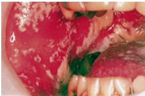
Figure 2 Acute pseudomembranous candidiasis.

tongue. The tongue may be bright red similar to that seen with a low serum B12, low folate, and low ferritin. Diagnosis may be difficult but should be considered in the differential diagnosis of a sore tongue especially in a frail older patient with dentures who has received antibiotic therapy or who is on inhaled steroids. A swab from the tongue/buccal mucosa may help diagnosis.