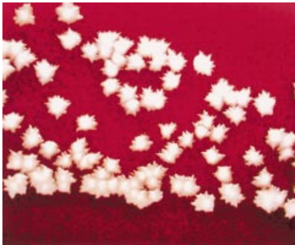
Figure 1 Candida albicans as seen under light microscopy.