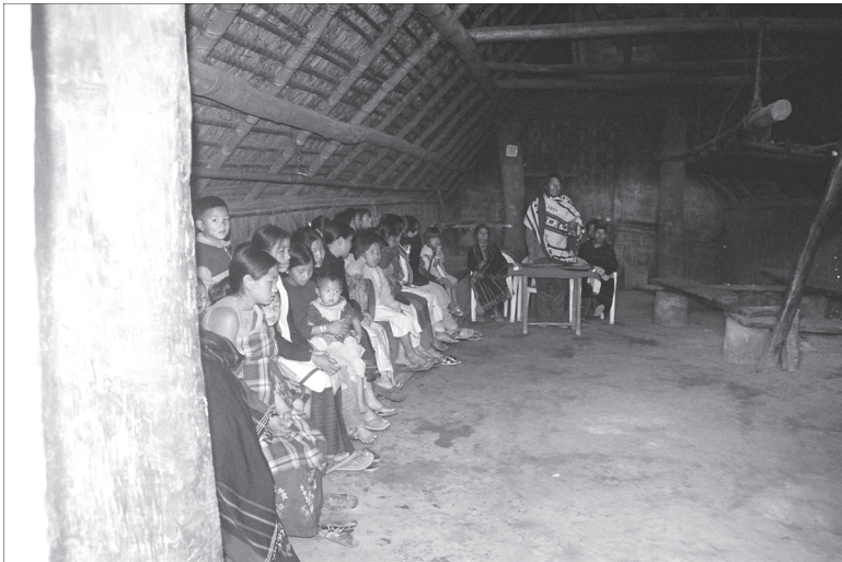
Figure 2 Telung Ndui meeting in Hsongle village, 2005

The emphasis on lifestyle is evident in meetings such as the Telung Ndui (cultural meetings; see Figure 2), where mostly women and children are taught how to cook, clean, and minimise the use of water while achieving maximum cleanliness. The idea of maintaining the home as the inner sanctum is positively reinforced by the Heraka, albeit only recently. Figure 2 illustrates the way women are often instructed by an elder of the village (in this case a male) about the role of women in maintaining the homestead and providing a sanctuary for the overall development of the family. This attitude towards domesticity as a virtue came about when less attention was placed on agriculture and more on the education of children. Previously, the agricultural fields were the primary place of