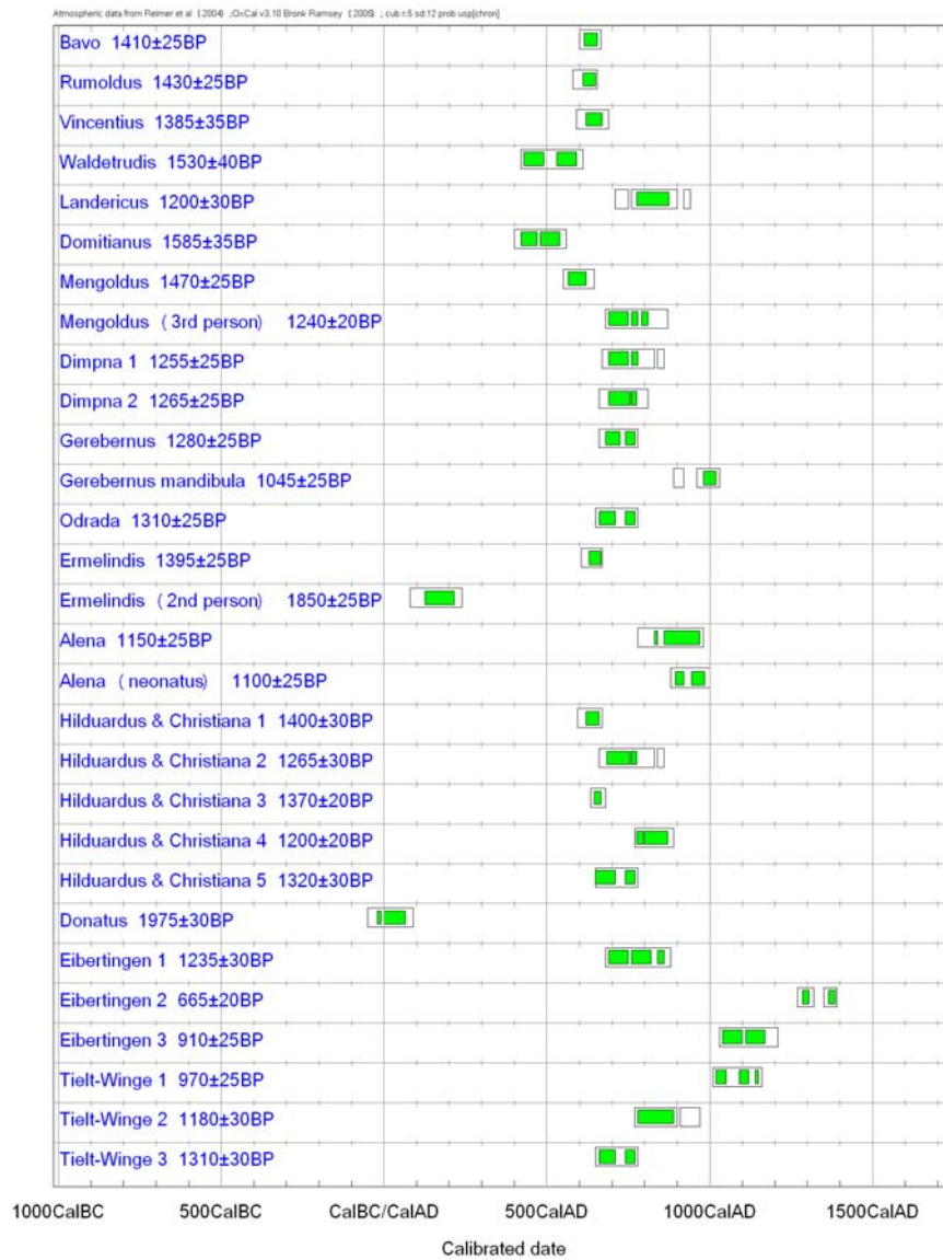
Figure 2 Calibrated 14 C ages from skeletal material from Belgian saints

and Georges 1982). Documents other than his vita endorse the existence of Domitianus. This, however, is not the case for Mengoldus. The relics ascribed to Domitianus represent a single skeleton, but the collection of bones supposed to have belonged to Mengoldus contains elements of a third individual. 14 C dates place the remains of Domitianus in the 5th or the first half of the 6th century AD, while the bones of the skeleton believed to represent Mengoldus date back to the second half of the 6th or the first half of the 7th century AD. The admixture of bones to this last skeleton gave a broad dating from the end of the 7th to the late 9th century AD. The second relic thus presents problems in terms of authenticity, although it is still an early medieval artifact.