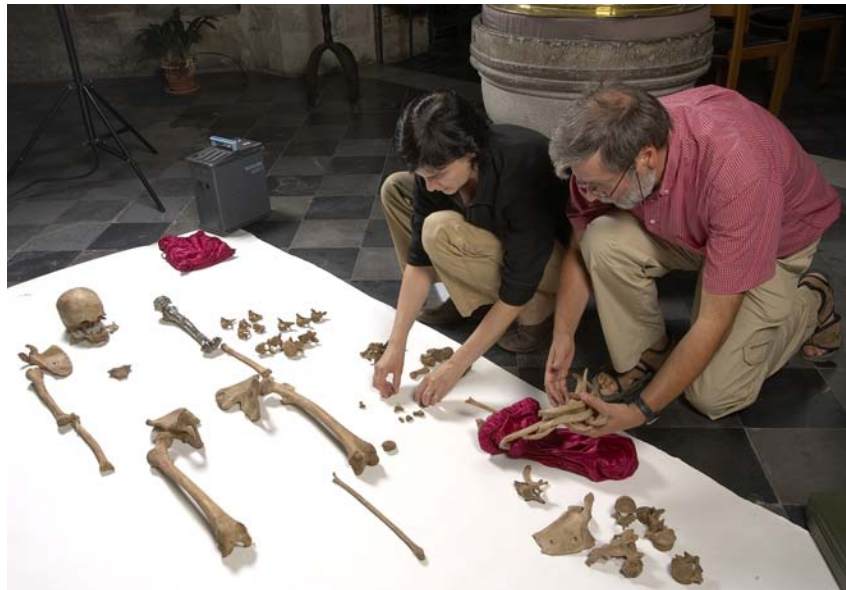
Figure 1 Reconstruction of the skeleton of Alena

It should be noted that this project focused upon the skeletal remains of so-called “local” saints. These are saints that have or had only a limited regional impact and that were only worshiped in a geographically very restricted area. Some of the saints represent people whose existence has been attested by reliable historical sources, while others clearly are legendary figures (Figure 1).