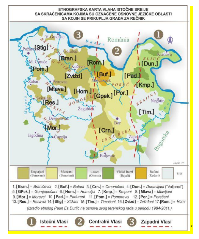
Figure 2. Interactive map of the regions inhabited by Vlachs and of the Vlach groups (http://www.paundurlic.com/vlaski.recnik/pretraga.php)

The option Search , apart from offering the possibility to query the lexicon database by word, prefix, suffix, the Romanian or Serbian translation of the word, number of the word or geographical region, also comprises interactive maps which offer the visitors the possibility to query the lexicographic material by clicking on the regions on the map.