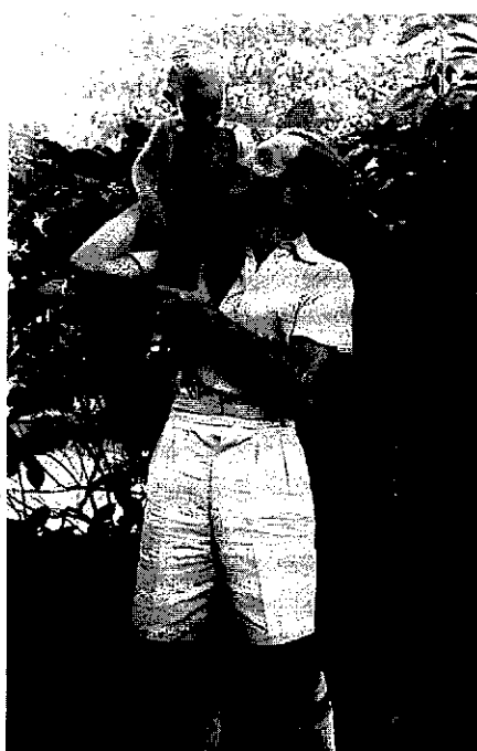
Figure 6. 'A father and his child,' ca. 1935. KIT album 583/23.