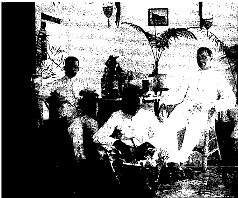
Figure 3. From a family album, ca. 1900.