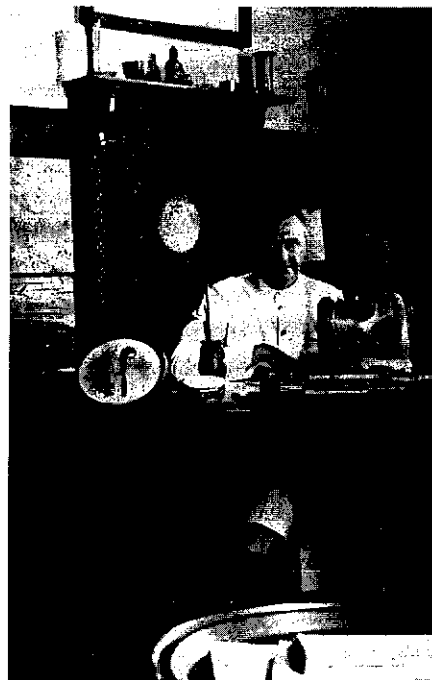
Figure 5. 'A father and his daughter,' ca. 1935. Photos like this one (and like fig. 6)—of European men in the Indies alone with their children—are rare, and even more so for the nineteenth century. KIT album 583/31.