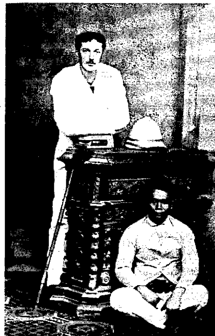
Figure 1. A calling card from Java, ca. 1890s.

Moreover, heterosexual unions based on concubinage and prostitution across the colonial divide were defended as a “necessary evil” to counter those deemed more dangerous still—carnal relations between men and men. The question is not whether these were real dangers and thus whether their claims were true or false. The task is rather to identify the regimes of truth that underwrote such a political discourse and a politics that made a racially coded notion of who could be intimate with whom—and in what way—a primary concern in colonial policy. The colonial measure of what it took to