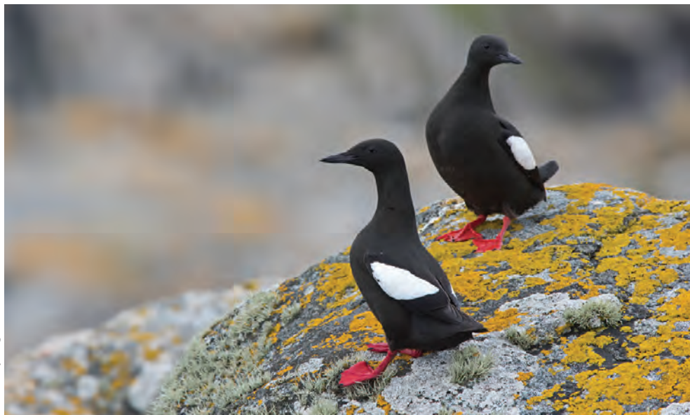
360. Black Guillemots Cephus grylle , Shetland, June 2016. Black Guillemot moved to the Green list in UK BoCC5a . The species was previously Amber-listed owing to range decline but Seabirds Count suggests little range change over the last 50 years. The species qualified as Near Threatened in GB IUCN2a , owing to predicted future declines under a 2°C global warming scenario by 2050.

by 52% between Seabird 2000 and Seabirds Count (Burnell et al. 2023) and there is no evidence of recovery since then.