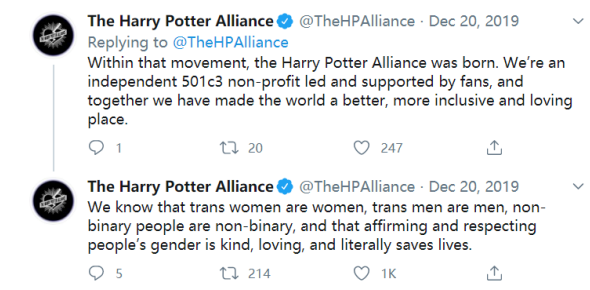
Fig. 7. Screenshot of the Harry Potter Alliance Twitter page.

As Fig. 6 shows, J. K. Rowling appears to be the second most searched thing in relation to Death of the Author on Google; originally Death of the Author was only a 1967 essay by French literary critic Roland Barthes. In his essay Barthes argues against the traditional literary criticism's practice of including the intentions of the author as well as the biographical context to interpret a text. Barthes claims that the art and the creator are to be considered unrelated. In today's terms, Death of the Author is a term that does still retain the original meaning, but also it has become in recent years a way of detaching a beloved piece of word from an author that proved themselves to be either racist or homophobic on simply not in line with today's standards. In the case of Rowling, there is still a discussion on whether people who love and respect transpeople should or should not consider the death of the author, reason being Rowling though she has become a very influential author and as such she should be careful on what she says on social medias, however she has always been supporting toward most minorities and it would be hard to detach her persona from Harry Potter when she is still so active in the world of the books and continues to speak about them on a daily basis. In the following screenshot (Fig. 7), groups and association like The Harry Potter Alliance, decided not to go against the art, but only against the author [17].