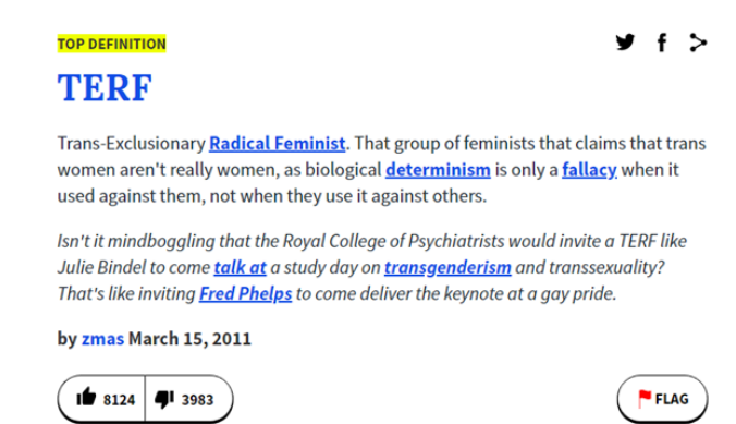
Fig. 3. Top definition of TERF on the urban dictionary.

slang used by users to describe a person who does not support transwomen's rights; as many other vocabularies birthed by the web, TERF has become widely used in the online community. In the following images taken from Urban Dictionary, a few examples of how the word TERF is used.