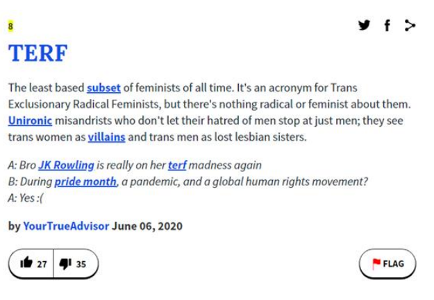
Fig. 2. 8th definition of TERF on the urban dictionary.

"I feel its fine to have nostalgic feelings for books like harry potter, and appreciate the world and art behind them.... it's an entirely different thing to continually support and turn a blind eye to a clear TERF and fake ally to queer community. #Idontstandwithmaya" (Twitter User Yovska. 2019, December 19).