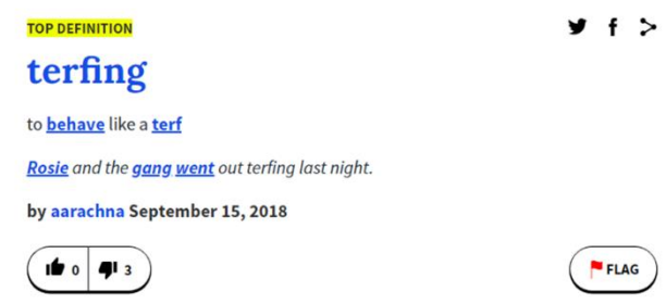
Fig. 4. Definition of terfing by Urban Dictionary.

The word TERF can by used as an adjective by adding y to it, TERFy. The suffix y, that serves the purpose of transforming the acronym into an adjective, is written in lower case, most likely to avoid confusions. The form terfy though, written completely in lower case, can also be found on the web.