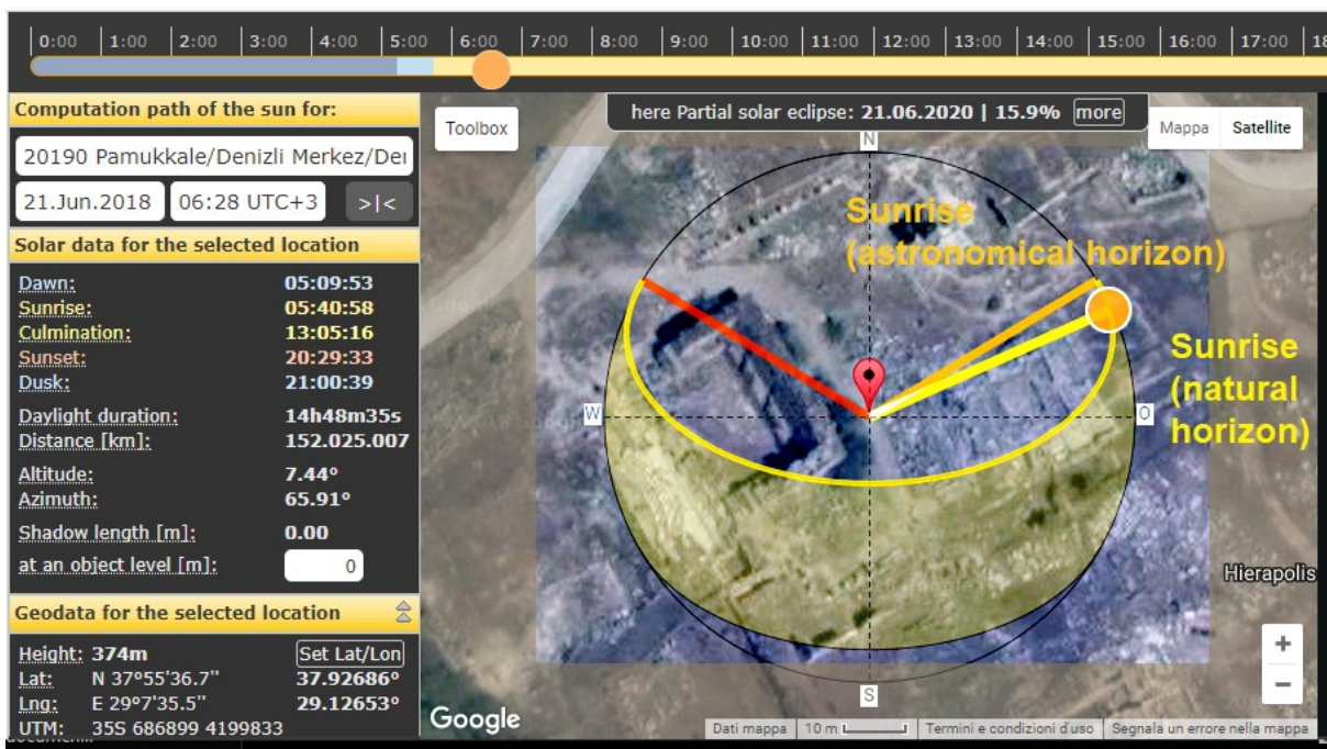
Figure 2. SunCalc.org software screenshot, for the temple of Apollo Lairbenos, on June 21. We can see the directions of sunrise and sunset on the local astronomical horizon and the azimuth of the sun when it has an altitude of 7.44 degrees. This is also the direction of the sunrise according to the natural horizon.