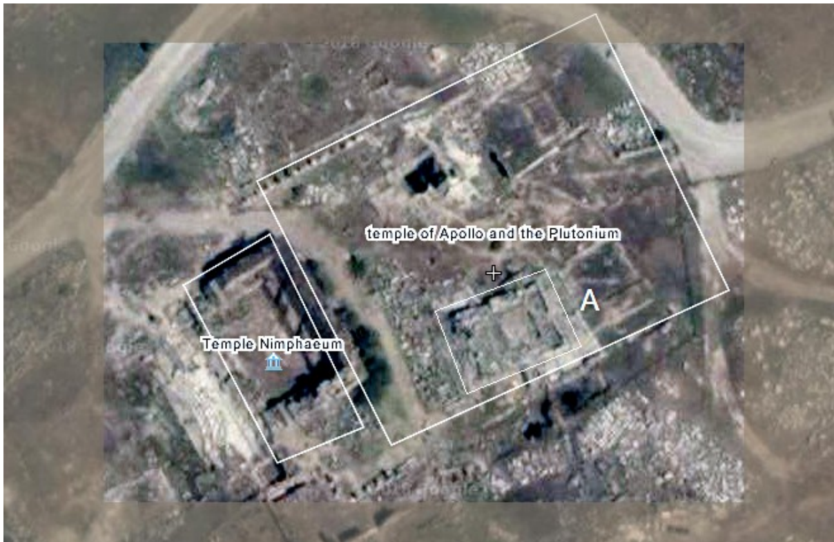
Figure 1. The temenos of the temple of Apollo Lairbenos in Hierapolis and the Nymphaeum, as given in Wikimapia. Site A indicates the temple as considered in Ref.7.