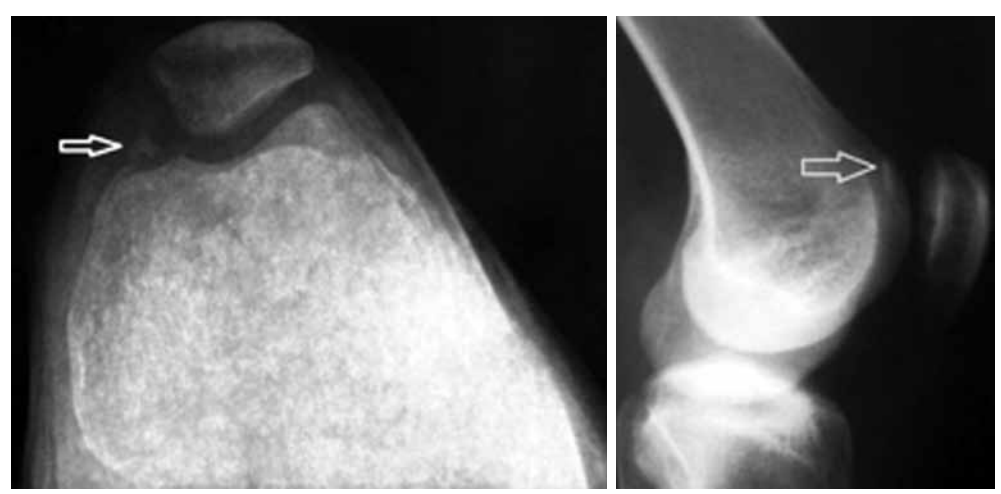
Figure 1. Radiological view of the knee, calsified pilica shown by the arrow.

is not among the classifications given above and in the literature.