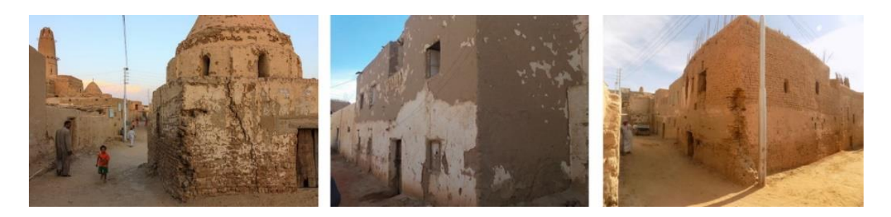
Fig. 17. Homes that are cracked and have a lot of problems in Al-Qasr.

Al-Qasr city suffers from sewage problems affecting the safety of some historic buildings and weakens the foundation of it especially that a lot of these buildings require restoration and support and some other buildings suffer from cracking and partial collapse as shown in Fig. 18. The government will continue its sewage project for the city with a cost estimation of 20 million Egyptian pounds, the project will be opened in 2018 to solve the sewage problem completely.