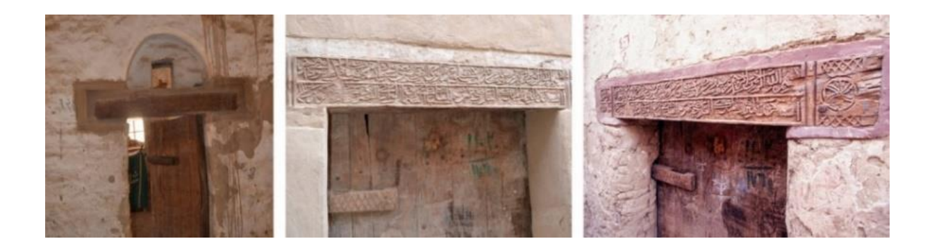
Fig. 9. The wooden sills above the doors with the house construction year [12].

In spite of the unique historic value of Al-Qasr Islamic city, it remained inhabited by people until very recent time that doesn't exceed 20 years, see Fig.10. And after the residents moved to Al-Qasr new city near the historic city, they used it as storage for their old belongings and crops until the ministry of antiquities took off its property from the people in order to preserve the historic city and its houses. Only some blacksmiths and pottery workers still live in their old district in the ends of the city. Al-Qasr new city project includes 200 residential units in Al-Dakhla city in alwadi aljadeed with 45 million pounds cost.