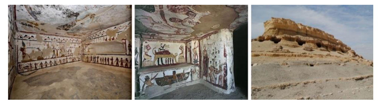
Fig. 14. Almazoka tomb in Al-Qasr city.

The city includes a tomb called "almazoka" that is five kilometres away from Al-Qasr city and is one of the 600 roman archaeological tombs of roman governors that reached this area and dug their tombs in the mountain rocks; it was called "almazoka" for having very bright colours, see Fig. 14.