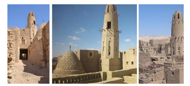
Fig. 11. Nasr Eldin mosque minaret from the ottoman period.

school dating back to the first Islamic eras and sheikh nasreldin mosque that is considered one of the oldest remaining mosques in Egypt as shown in Fig.11 and 12.