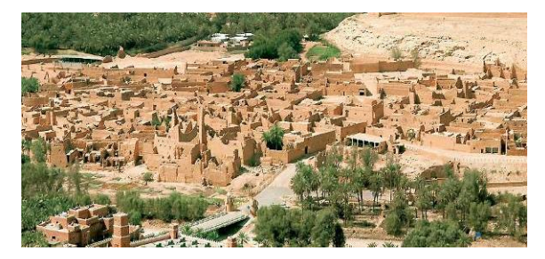
Fig. 6. Photo of Altareef district in Aldaraeya. [9]