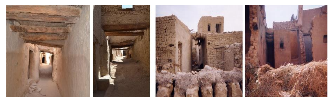
Fig. 16. The city's streets are roofed by wood and palm stools.

The local building materials had a significant role in providing warmth in winter and mitigating the summer temperature through using bricks and wood and palm stools for making roofs and doors, as shown in Fig.16.