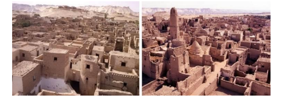
Fig. 15. The urban tissue of historic Al-Qasr.

Different architectural arts were embodied in the architecture of Al-Qasr Islamic city such as religious architecture in Nasr Eldin mosque minaret from the ottoman period as well as funerary architecture such as the grave of sheikh Emad Eldin, the remaining architecture is civil architecture such as houses. Most of these buildings are dated back to the Turkish ottoman period yet this city still has early Islamic monuments traces, there is qibla wall in the southern part of the city dating back to the first hijri century. The Dutch institute delegation found some monuments dating back to the Fatimid era as well as Mamluk period in Al-Qasr city, see Fig. 15.