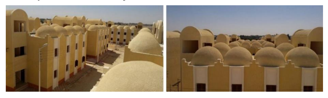
Fig. 10. Al-Qasr new city in Al-Dakhla city in Alwadi aljadeed.

In spite of the unique historic value of Al-Qasr Islamic city, it remained inhabited by people until very recent time that doesn't exceed 20 years, see Fig.10. And after the residents moved to Al-Qasr new city near the historic city, they used it as storage for their old belongings and crops until the ministry of antiquities took off its property from the people in order to preserve the historic city and its houses. Only some blacksmiths and pottery workers still live in their old district in the ends of the city. Al-Qasr new city project includes 200 residential units in Al-Dakhla city in alwadi aljadeed with 45 million pounds cost.