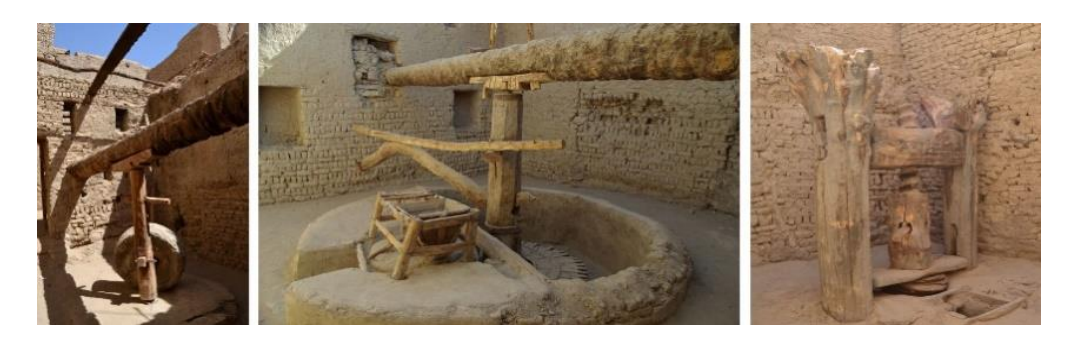
Fig. 19. Abo-Ismail mill restoration one of historic buildings in Al-Qasr.

The Japanese government provided support to restore Al-Qasr city provided that the restoration is made by the same materials that the city was built by, to preserve the architectural heritage as well as to maintain the satisfaction of the people living in the city by bringing the city back to its original style not to damage its archaeological shape. The start of the second last phase of the project is supposed to be in 2018.