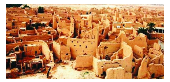
Fig. 5. Altareef district in Aldaraeya [9].

aim at activating the area in a compatible way with its cultural and urban environment as shown in Figs. 5, 6.