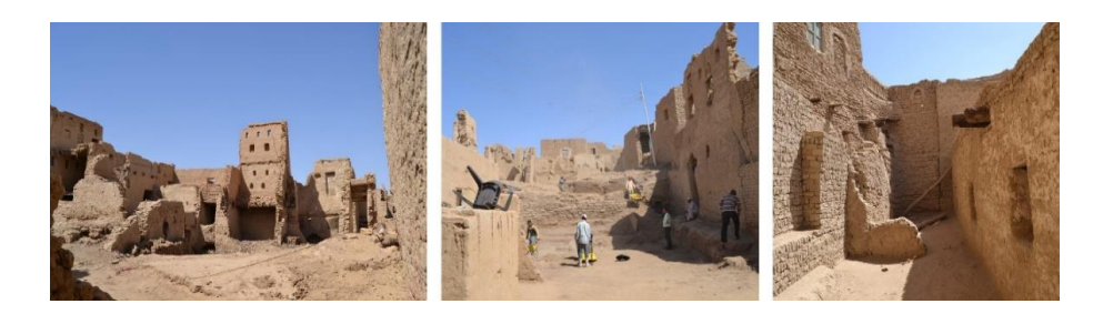
Fig. 20. Project of the restoration of the village using the same building materials and mud brick with popular participation.