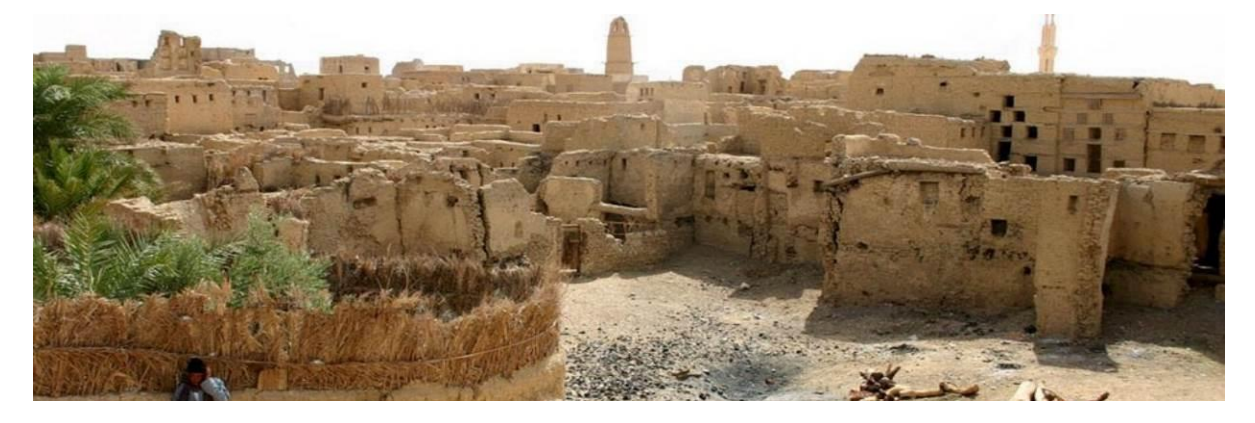
Fig. 18. A part of the old city suffers from neglect, cracking and demolition.

Al-Qasr city suffers from sewage problems affecting the safety of some historic buildings and weakens the foundation of it especially that a lot of these buildings require restoration and support and some other buildings suffer from cracking and partial collapse as shown in Fig. 18. The government will continue its sewage project for the city with a cost estimation of 20 million Egyptian pounds, the project will be opened in 2018 to solve the sewage problem completely.