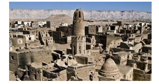
Fig. 12. Nasr Eldin mosque in the urban context.

The oldest sill in Al-Qasr city dates back to 914 hijri year in the house of Mohamed khatb, the city's biggest house of judge Omar Inbalkas Sebaey, the ottoman oasis man of Al-Qasr city, consisting of four floors and was built in year 1113 hijri containing Fatimid architectural art, see Fig. 13.