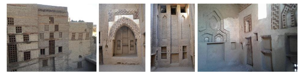
Fig. 13. The house of Mohamed Khatb back to 914 hijri.

The oldest sill in Al-Qasr city dates back to 914 hijri year in the house of Mohamed khatb, the city's biggest house of judge Omar Inbalkas Sebaey, the ottoman oasis man of Al-Qasr city, consisting of four floors and was built in year 1113 hijri containing Fatimid architectural art, see Fig. 13.