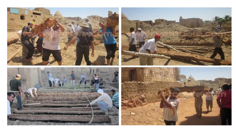
Fig. 21. Graduated youth that participated in the restoration of Al-Qasr Islamic city [13].