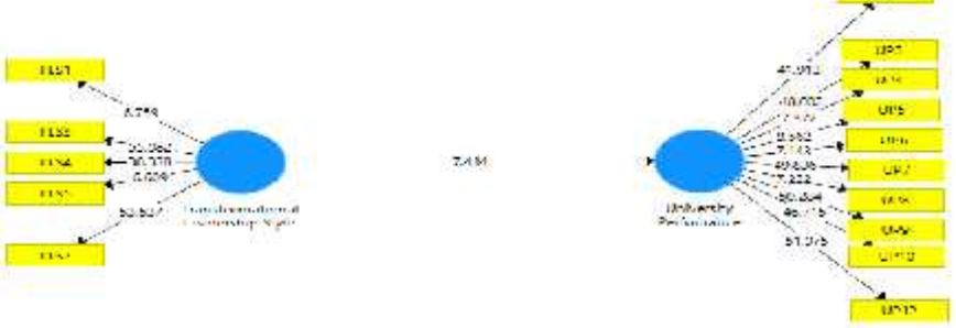
Figure 2: Smart PLS Bootstrap Graph for the study

It was suggested that; a good parsimonious model is the one with high R^2 value explained by relatively fewer independent latent variables. As in this case of this study, the R^2 value is 0.330 with adjusted R^2 of 0.319 and it deemed satisfactorily since it has exceeded 1.5% as argued by Falk and Miller (1992). Additionally, the model has only one independent variable and one dependent variable.