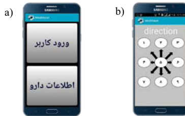
Figure 2.a) nine-directions UI for visually impaired users' navigation b) two-buttons UI for visually impaired users

The android application was developed in Android Studio. According to target group of this study, the application was designed in Persian language. The application user interfaces (UIs) are divided to UIs for people with visually impairment and UIs that are used for medication registration. Two kinds of user interfaces (UIs) were employed for visually impaired user. In the first UI type, the designer divide the screen of smartphone with two buttons. Therefore the visually impaired user can be guided by audio commands to touch the top half of screen for a specific task and bottom half of screen for another one (Figure 2.a). Another UI, is comprising of nine direction in the screen which each direction is representative of the number from one to nine. Each number is corresponding to a particular task. In this type of the UI the audio command announces the task of each number and the user drag his/her finger on the screen in order to input a number for specifying a certain task. For example, the number two will be selected by dragging the finger from middle of screen to top (Figure 2.b).