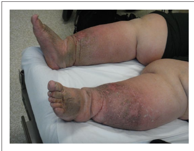
Figure 3. Lymphedema: involvement of skin with inflammation and fibrosis is common in lymphedema and feet are involved.

of the trunk and upper extremities. 8 Initially, the first sign indicating the development of lipedema may be filling of the retro-malleolar sulcus on both lower extremities; in