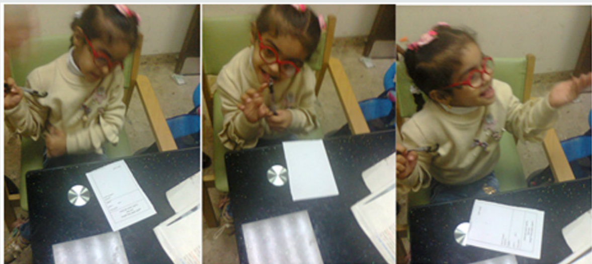
Figure 2B: The girl with kernicterus after two months treatment.