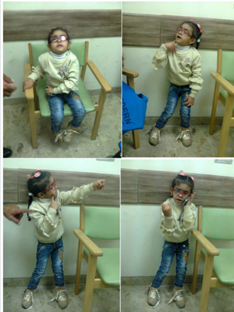
Figure 2A: The girl with kernicterus before treatment.