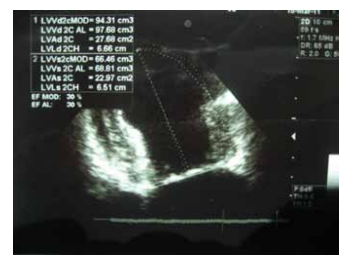
Figure 2. Echocardiography showing reduced left ventricular systolic function (ejection fraction about 30% by Simpson)

Echocardiography results revealed severe left ventricular systolic dysfunction (ejection fraction about 30%) with marked regional wall motion abnormalities in the mid anterior, mid-septal, mid inferior, and apical segments of the left ventricle (Figure 2).